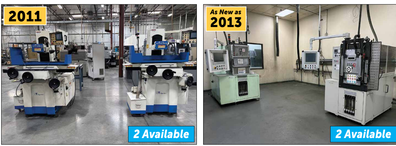
View of Supertec STP-618CII Automatic Surface Grinders

View of MAC and Idea Vulcan Sintering Furnances