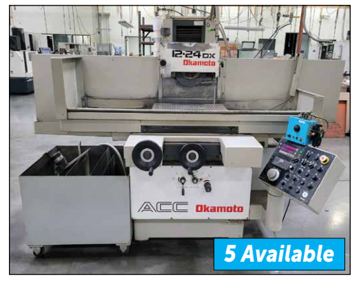
Okamoto ACC12-24DX Automatic Surface Grinder