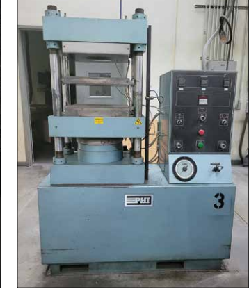
PHI S75R1818S Compresssion Molding Press