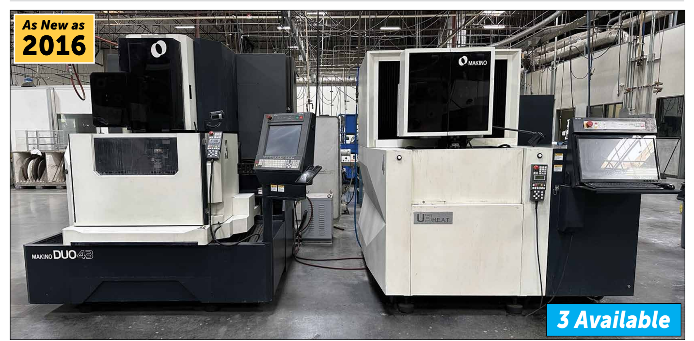
View of Makino DUO43 and U3 Wire EDM's

COMPLETE FACILITY FEATURING: Makino Wire EDM's as New as 2016, (30) Okamoto, Kellenberger & Supertec ID, Surface Grinders as Late as 2022, Vacuum Sintering Furances, Compression Molders, Ultra Precision Diamond Sllcing and Dressing, And Much More.