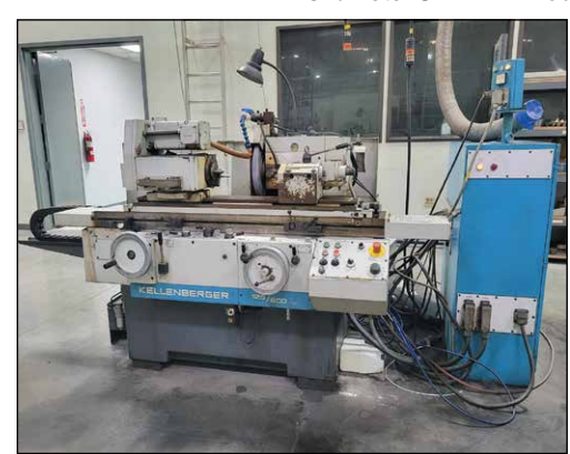
Kellenberger UR125/600U Universal ID/OD Grinder

Supertec G20P-50NC Universal Cylindrical Grinder