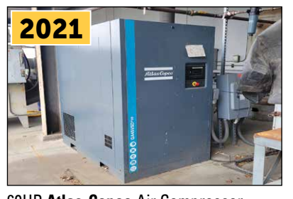
60HP Atlas-Copco Air Compressor