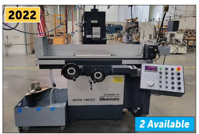
Okamoto ACC6-18DX3 Automatic Surface Grinder