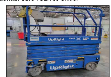
Upright MX19 Scissor Lift