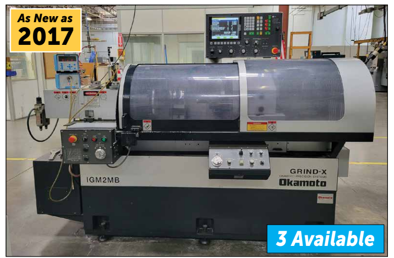
Okamoto IGM-2MB Precision ID Grinder