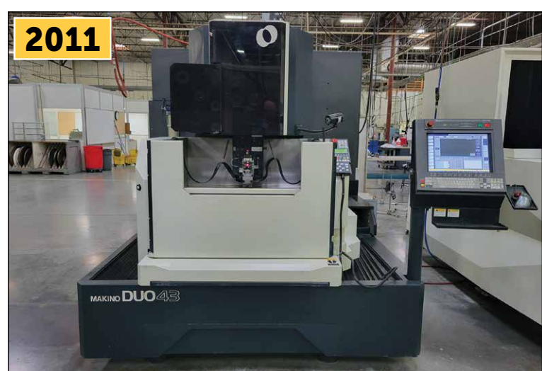
Makino DU043 Wire EDM GRINDERS