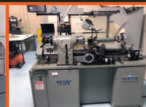
Sharp 1118H Lathe