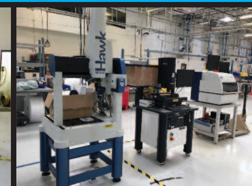
Hawk CMM & Quality Control Equip.