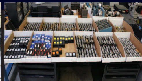
View of Tooling