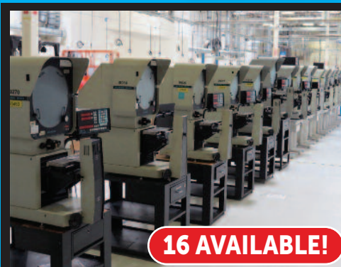
Deltronic Optical Comparators

ONSITE INSPECTION: Monday, November 26 from 9:00am to 4:00pm PST AUCTION DATE: Tuesday, November 27 at 10:00am PST LOCATION: 6221 El Camino Real, Carlsbad, CA 92009