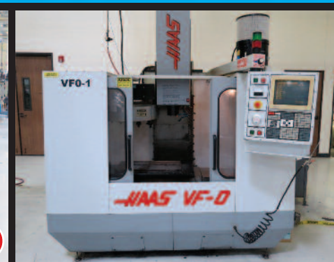
Haas VF-0 CNC VMC