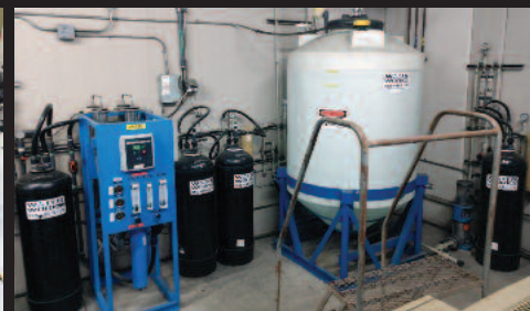
Water Works Salt Water Softner System

www.machinerynetworkauctions.com | 818.788.2260