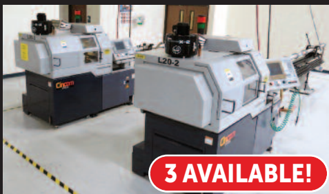
View of Citizen Cincoms

FEATURING: (3) Citizen L20 CNC Swiss Screw Machines, (23) LNS Gatling Bar Feeds, Fadal VMC-3016, HAAS VF-0, Sulzer Metco Multi Coat Spray Booth System, (16) Deltronic Optical Comparators, (10) Euclid Kilns Lab Ovens, Ultrasonic Part Washer, Dust Collectors, (5) Kaeser Air Compressors New as 2011, Huge Quantity of Tooling, Lista Cabinets, Office, and Much More