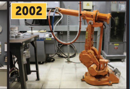
Sulzer Metco MultiCoat Spray Booth System