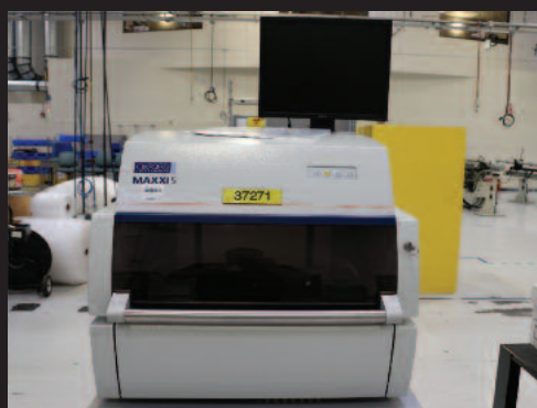
Oxford Maxxi 5 Metal Analyzer