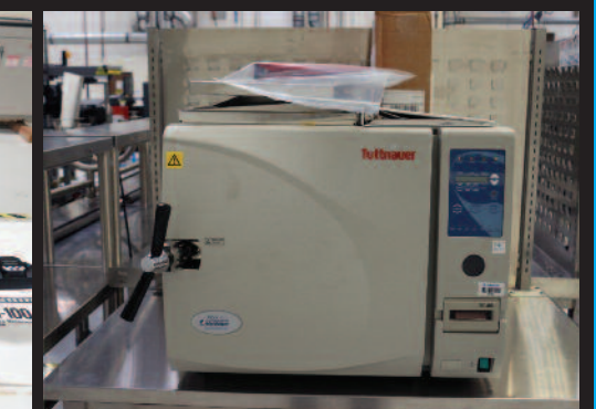
Tuttnauer 3850 Autoclave Sterilizer