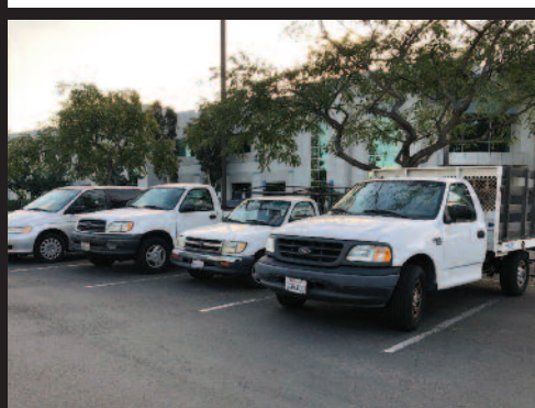
View of Vehicles