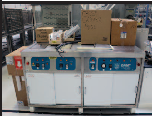
Crest Ultrasonic Parts Washer