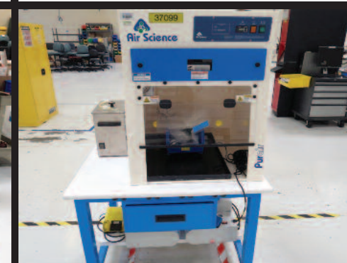
Air Science PurAir PS-24 Fume Hood