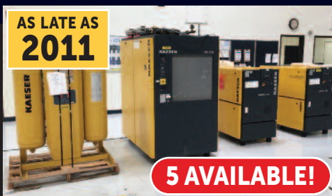
View of Kaeser Air Compressors

www.machinerynetworkauctions.com | 818.788.2260