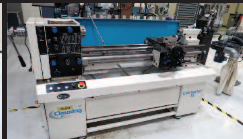
Clousing Colchester 13" Lathe