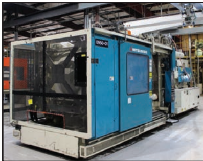
950-Ton Mitsubishi 950MMJW-160 Injection Molder