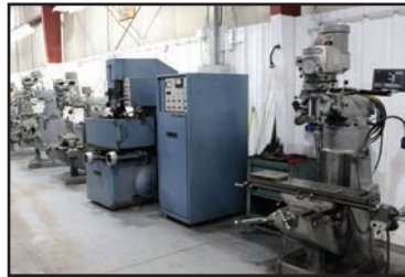
Overall View of Toolroom