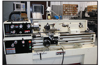
14" x 40" Jet Lathe