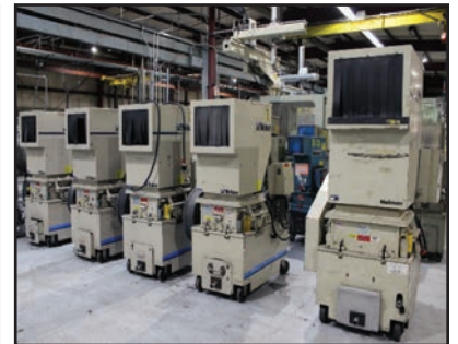
View of Nelmor Granulators