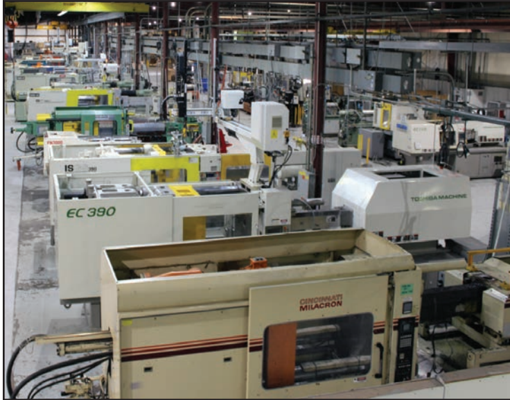
Overall View of Injection Machines