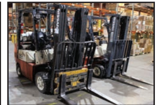
View of Forklifts