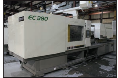
390-Ton Toshiba EC390V21-17 Elect. Injection Molder