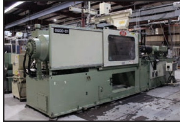
500-Ton Nissei FE460S160ASE Injection Molder