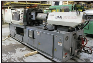
150-Ton Nissei FN3000 Injection Molder