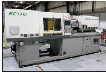
110-Ton Toshiba EC110-V21-2Y Injection Molder