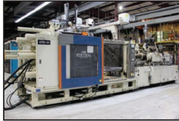
720-Ton UBE PZIII Injection Molder