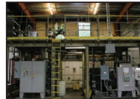
Pump Tank & Tower