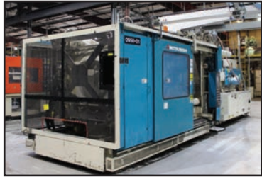
950-Ton Mitsubishi 950MMJW-160 Injection Molder

(18) Plastic Injection Molders up to 1,000-Ton Capacity New as 2001, from Toshiba, Nissei, Mitsubishi, Cincinnati, Van Dorn, and UBE. Plastic Auxiliary Equipment Including Large and Small Nelmor & Rapid Granulators, Robots New as 2016, Temptek Chiller System, Branson Sonic Welders, Tool Room Lathes, Bridgeport Mills, Quality Control, Faro Measuring Arm, Forklifts, Cranes, Facilities and Much More.