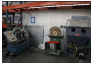
Cutting & Abrasive Station