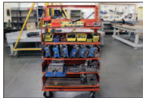
Kurt Mill Vises