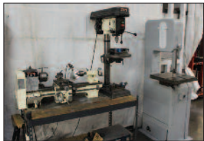
Manual Work Shop