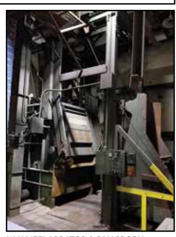
(3) WHEELABRATOR & PANGBORN Shot Blast Machines