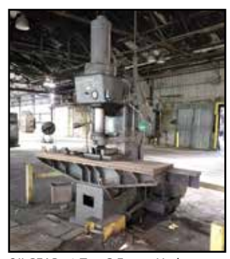
OILGEAR 50-Ton C-Frame Hyd. Straightening Press