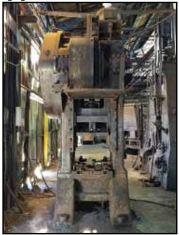
MINSTER 160-Ton Back Geared Straight-Side Single Crank Press