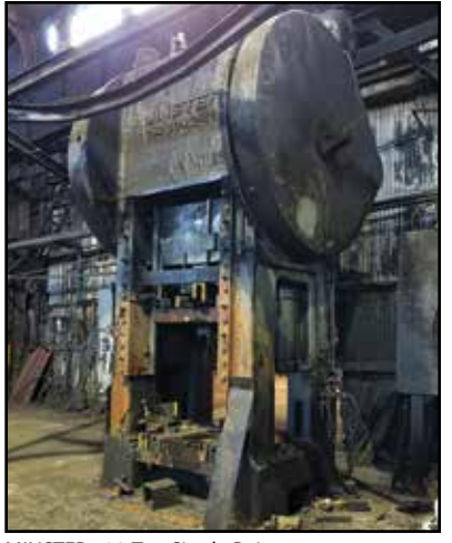
MINSTER 400-Ton Single Point Straight-Side Press