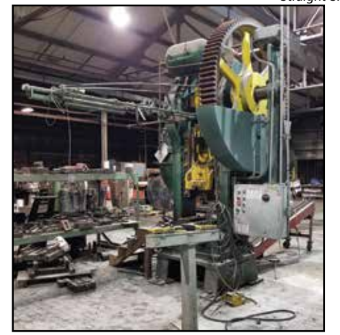
BLISS 125-Ton (Est) Straight-Side Single Crank Press