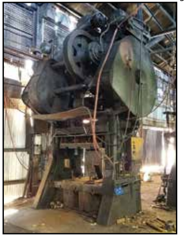
BLISS 200-Ton Straight-Side Double Crank Press