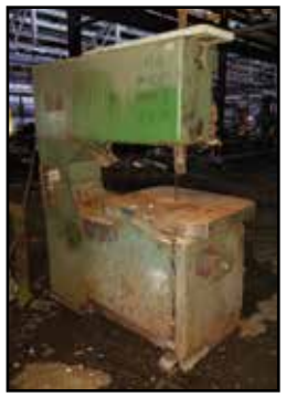
GROB 36" Vertical Band Saw