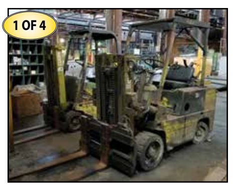
(4) CATERPILLAR 8,000-lb. Forklifts