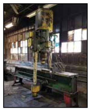
HPM 150-Ton Traveling Head 2-Post Axle Press