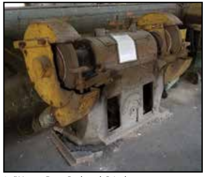
24" Heavy Duty Pedestal Grinder