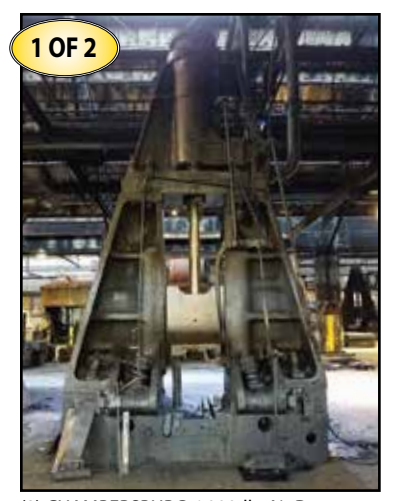
(2) CHAMBERSBURG 6,000-lb. Air Drop Forging Hammers