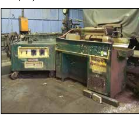
MAGNAFLUX Fluorescent Penetrant Inspection System

DROTT Go-Devil 8,500-lb. Carry Deck Crane, Model 85RM2, S/N 1005, 3-Stage Telescoping Boom, up to 1,200-lb. @ 16', Solid Yard Tires, Gas Powered (out of service)