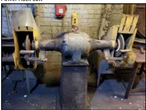
14" Heavy Duty Pedestal Grinder