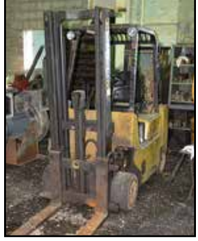
HYSTER FDRK 5 8,500-lb. Forklift