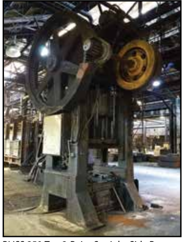
BLISS 250-Ton 2-Point Straight-Side Press