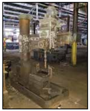
IKEDA 4'x 13" Column Radial Drill