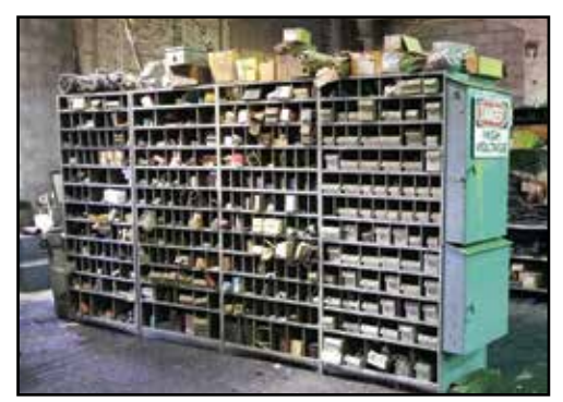
Large Inventory Repair/Shop Parts – Bulbs, Wire, Hardware, Fuses, Valves & More