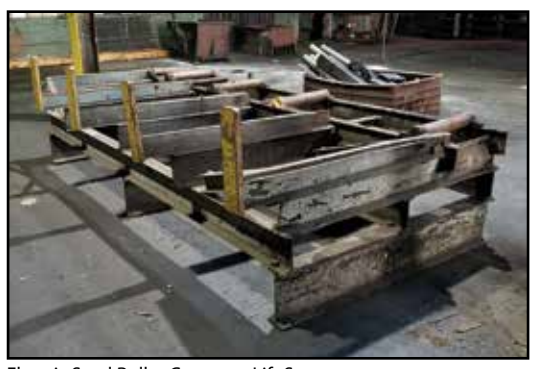
Electric Steel Roller Conveyor Lift System