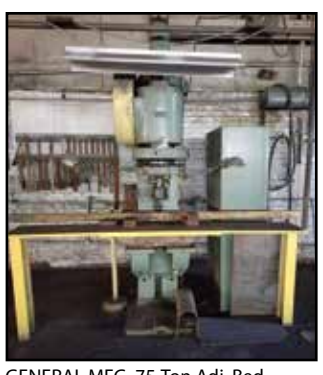
GENERAL MFG. 75-Ton Adj. Bed Horn Press