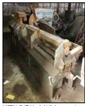
METALCUT Model XII Automatic Cold Saw