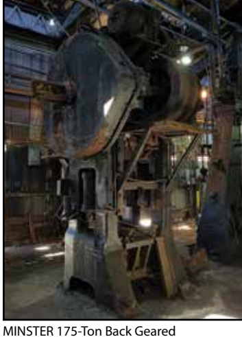
Straight-Side Single Crank Press