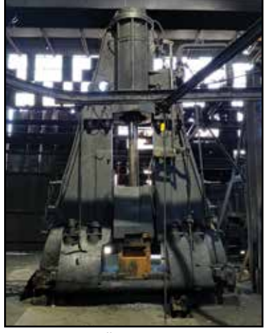
DOFASCO 10,000-lb. Air Drop Forging Hammer