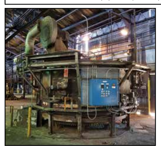
(16) Gas Fired Slot, Hearth & Fire Box Furnaces