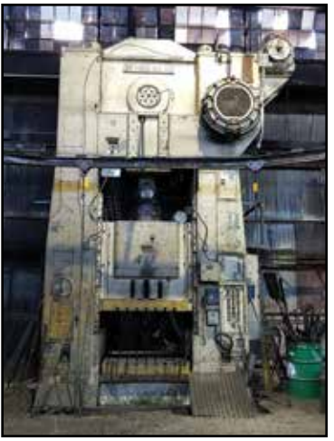
BLISS 600-Ton Single Point Eccentric Geared Straight-Side Press