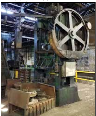
TOLEDO 200-Ton Straight-Side Single Crank Press