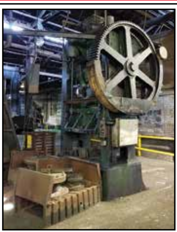
(20) TOLEDO, MINSTER, HPM, BLISS & CLEARING SS Hydraulic, Double & Single Crank Presses to 1,000-Ton