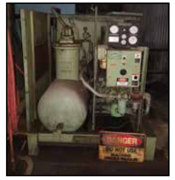
SULLAIR 125-HP Rotary Screw Air Compressor