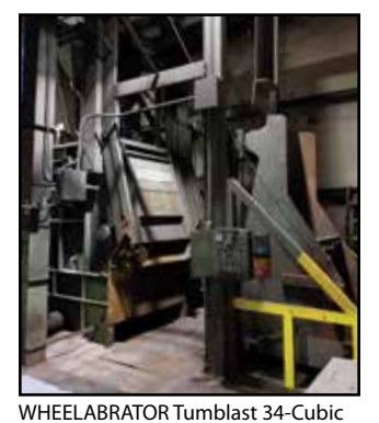
Foot Shot Blast Machine