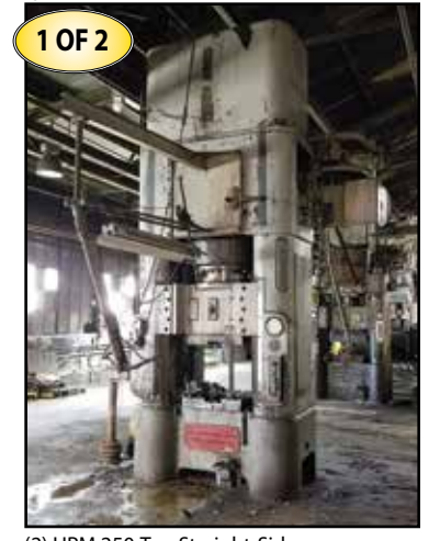
(2) HPM 250-Ton Straight-Side Hydraulic Presses