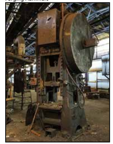
MINSTER 165-Ton Back Geared Straight-Side Single Crank Press