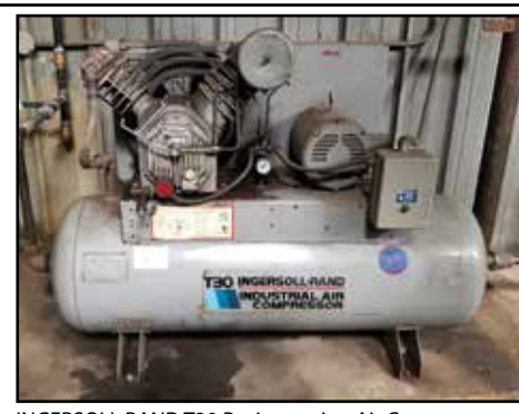
INGERSOLL RAND T30 Reciprocating Air Compressor