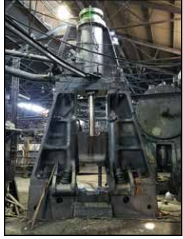
CHAMBERSBURG 8,000-lb. Air Drop Forging Hammer