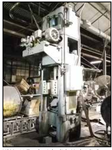
HPM 400-Ton Straight-Side Hydraulic Press