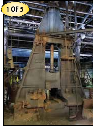
(5) ERIE 5,000-lb. Air Drop Forging Hammers