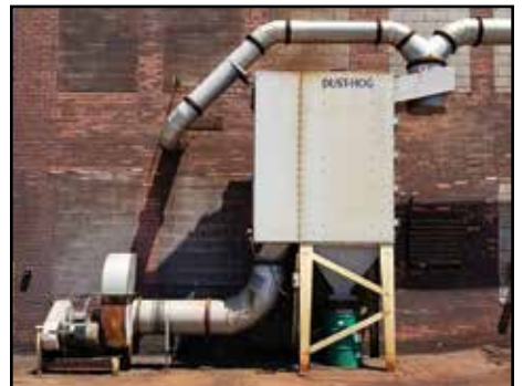
UNITED AIR SPECIALISTS Dust Hog Dust Collector