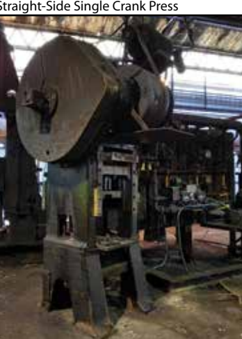
MINSTER 75-Ton Back Geared Straight-Side Single Crank Press