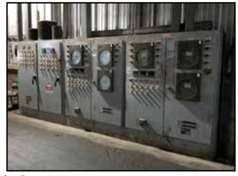
Heat Treat Line - (2) ELECTRIC FURNACE CO. 52'W x 30'L x 12"H Natural Gas Fired Pusher Furnaces