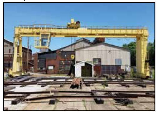
ALLIANCE MACHINE 15-Ton x 62' Rail-Mounted Gantry Crane