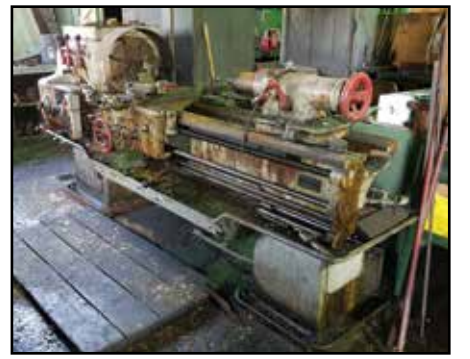
HENDEY 16" x 54" Geared Head Engine Lathe