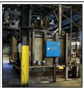
3' x 9' x 2'H 2-Door Gas Fired Box Furnace