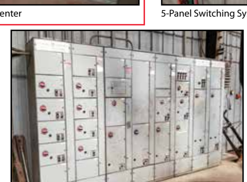
GENERAL ELECTRIC Master Control Center