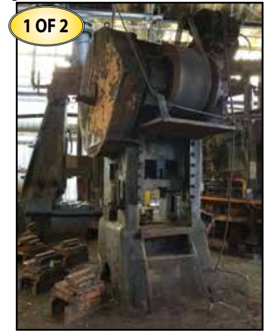
(2) MINSTER 135-Ton Straight-Side Single