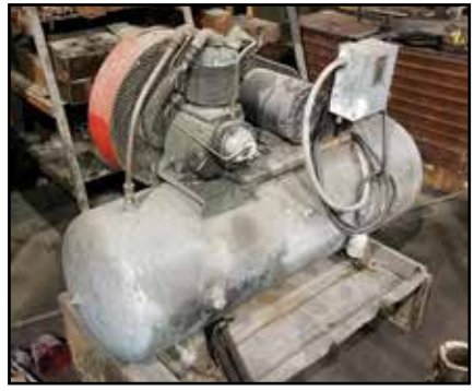
5-HP Reciprocating Air Compressor