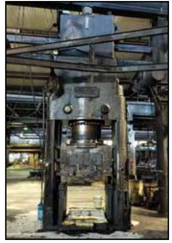
HPM 1,000-Ton Straight-Side Hydraulic Press