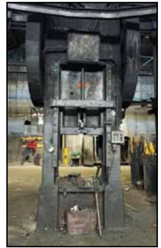
BLISS 250-Ton Straight-Side Double Crank Press

BLISS 125-Ton (Est) Single Crank Press, Model 66-1/3, S/N 408, 24" x 30"