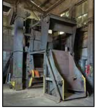
PANGBORN 26-Cubic Foot Shot Blast Machine