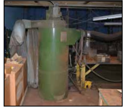
HAMMOND MFG. DusKolector Dust Collector