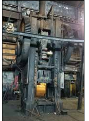
TOLEDO 600-Ton Straight-Side Double Crank Press