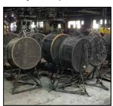
(50+) 24"-36" Shop Fans