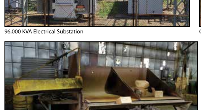
(2) TROFF Hydraulic Dump Tables