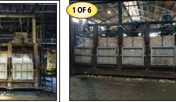
(6) 3' x 3' x 6'0 4-Door Gas Fired Box Furnace