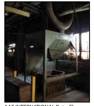
AAF INTERNATIONAL Rota-Clone Dust Collector