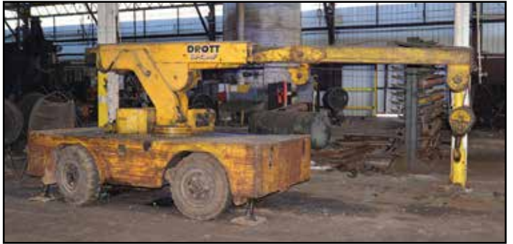
DROTT Go-Devil 8,500-lb. Carry Deck Crane