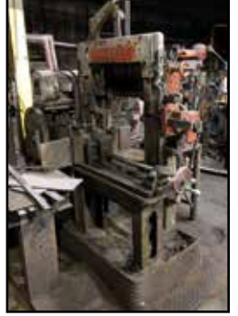
PEERLESS 11" x 14 Power Hack Saw