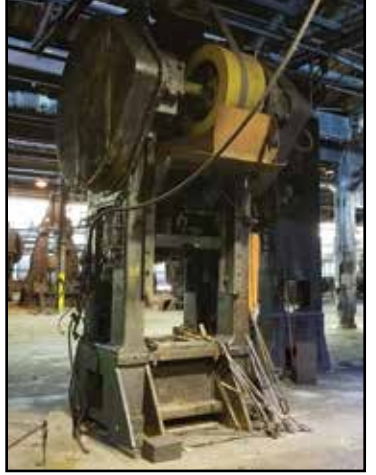
MINSTER 200-Ton Single Point Straight-Side Press