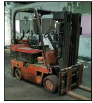
CATERPILLAR TC60D 6,000-lb. Forklift