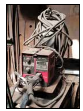
LINCOLN 600-AMP Arc Welder