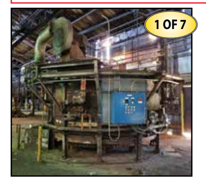
(7) 9' Gas Fired Rotary Hearth Furnaces