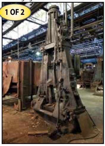
(2) ERIE 1,500-lb. Air Drop Forging Hammers