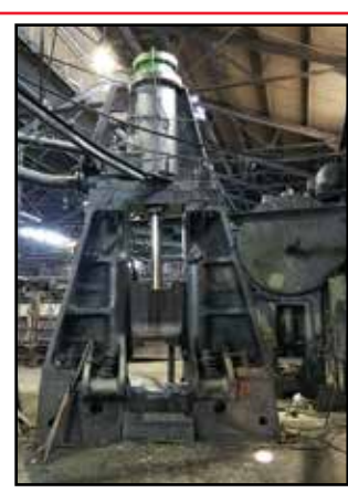
(20+/-) ERIE, DOFASCO & CHAMBERSBURG Air Drop Forging Hammers to 16,000-lb.