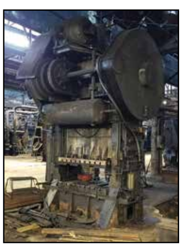
CLEARING 200-Ton 2-Point Straight-Side Press