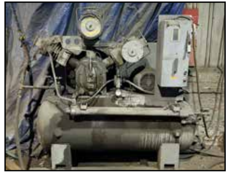
INGERSOLL RAND 10-HP Reciprocating Air Compressor