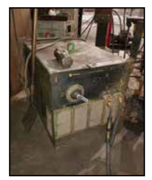
WESTINGHOUSE 750-AMP Arc Welder