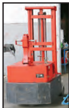
BIG JOE WALK-BEHIND FORKLIFT