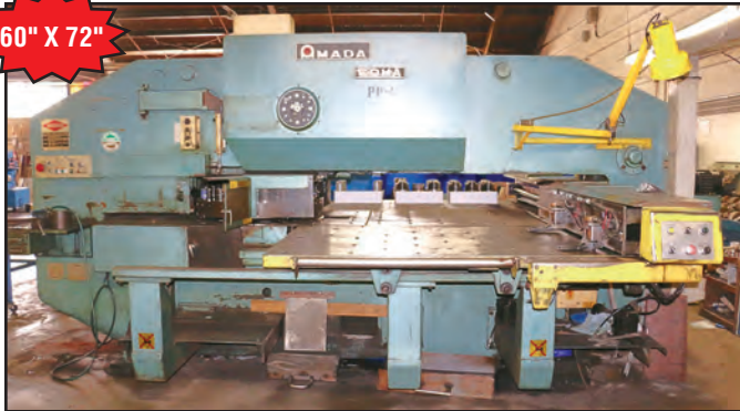
55-TON AMADA COMA CNC TURRET PUNCH

W CINCINNATI 175CB10 HYDRAULIC PRESS BRAKE