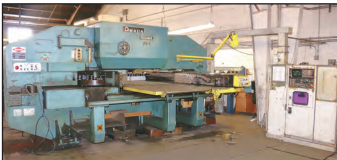
55-TON AMADA COMA CNC TURRET PUNCH