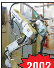
2002 OTC DAIHEN ALMEGA EX-MV 6-AXIS ROBOT