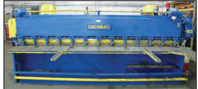
CINCINNATI MECHANICAL SHEAR W/SQUARING ARM