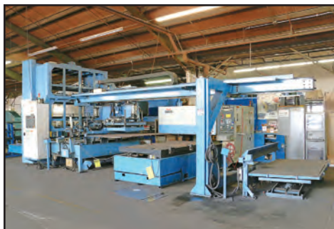
MAZAK FMS NT-X48 CHAMP CNC LASER CUTTING SYSTEM