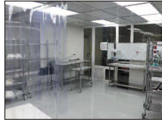
View of Neat Room