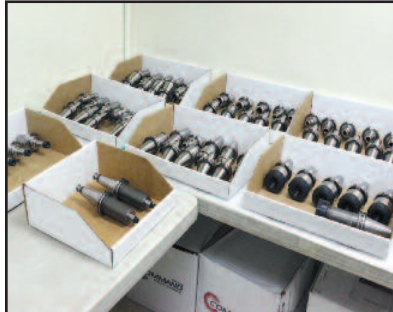
View of Tool Holders