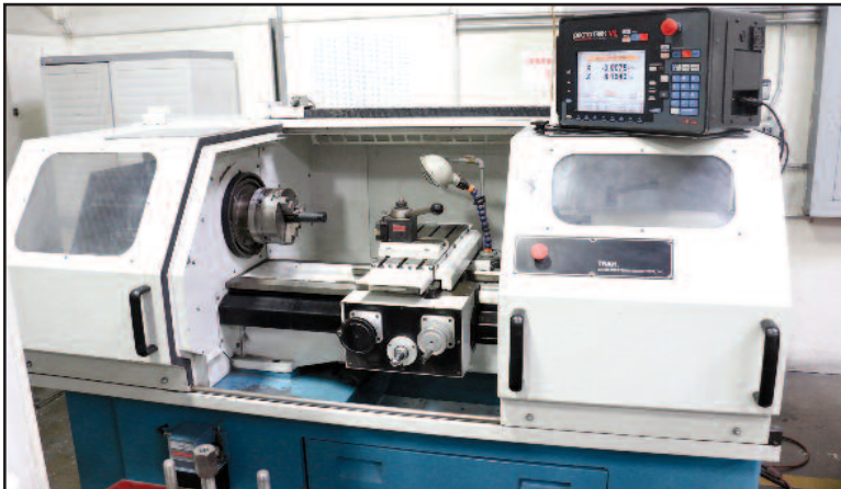
SWI Trak 1540V CNC Teach Lathe