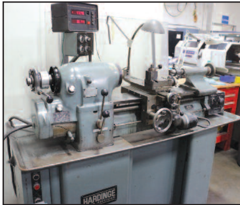
Hardinge HVLH Precision Toolroom Lathe