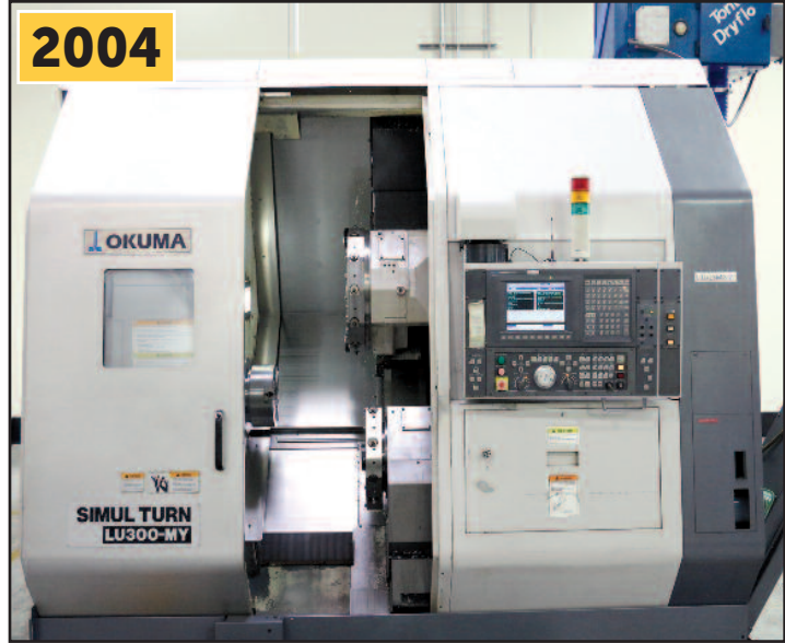
Okuma Simulturn LU300M-2SC600 CNC Turning Center