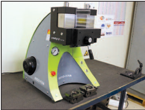
Rego-Fix powRgrip PGU950