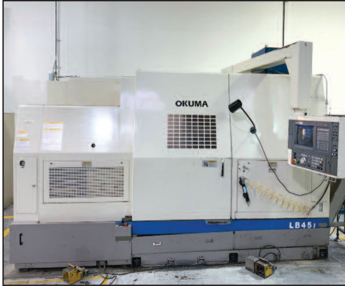
Okuma LB45 CNC Turning Center