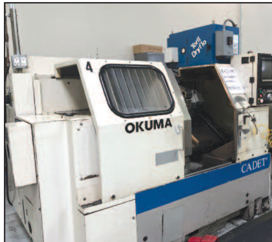
Okuma Cadet LNC8 CNC Turning Center