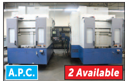
Mori-Seiki GV-503 Vertical Machining Centers