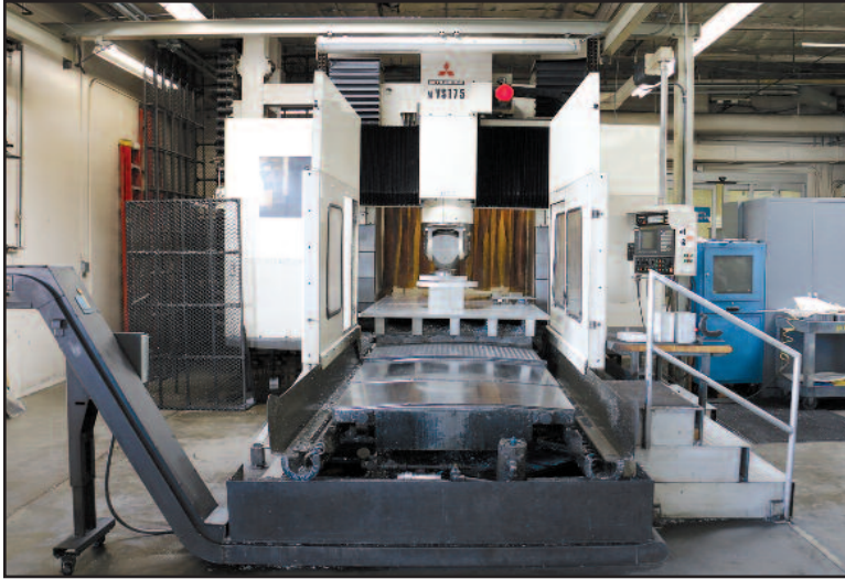
Mitsubishi M-VS 175 , 5-Axis, Fanuc 15M Control, 125" x 72" x 43" Travels, A & C-Axis Indexing Spindle, CAT 50 Taper, 80 ATC, 8,000 RPM, 25HP, CC, New 1998, S/N Q63870