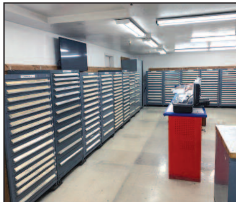
View of Tooling Room