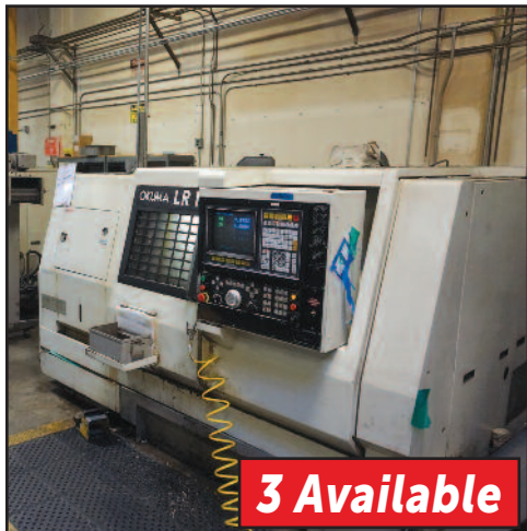
Okuma LR10 CNC Turning Center