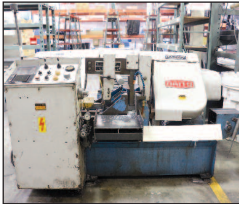
Daito Auto Horiz. Bandsaw