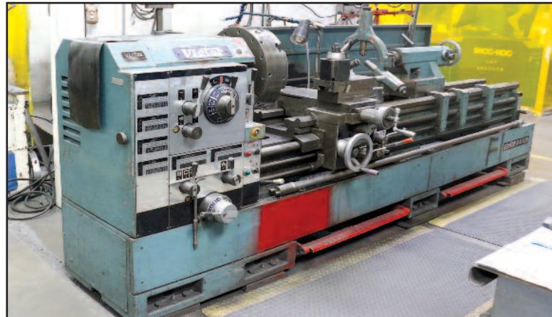
Victor 24100 Engine Lathe