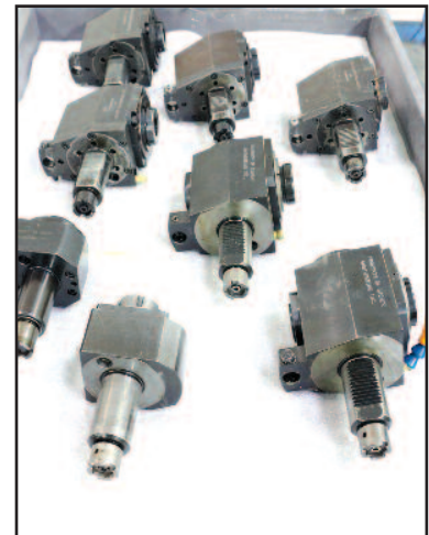
View of Tooling Inserts