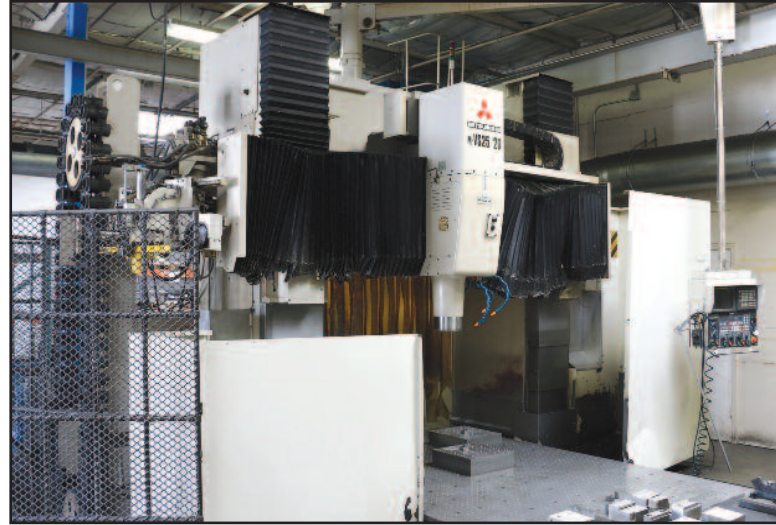
Mitsubishi M-VS 25/20 , 5-Face, Fanuc 18iM Control, 165" x 98" x 72", CAT 50 Taper, 60 ATC, Right Angle Head, 4,000 RPM, 30HP, CC, S/N OQ61020