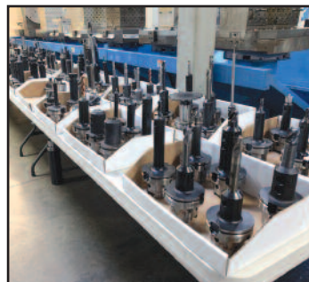
View of CAT Tooling