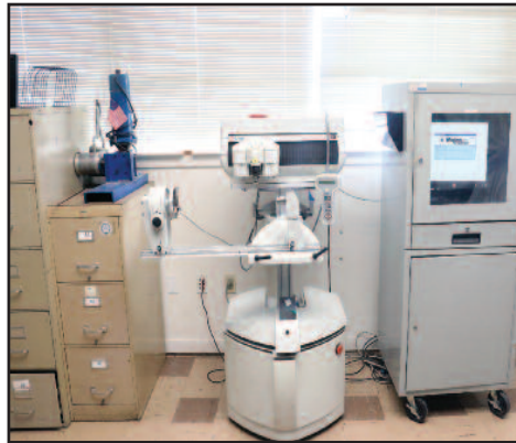
Gravo Graph IF400 Engraver