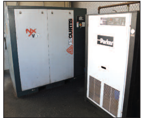
View of Air Compressors