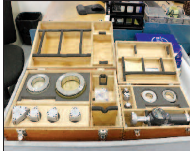
View of Inspection Equipment