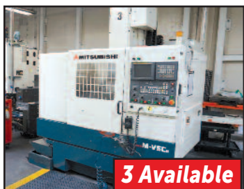
Mitsubishi M-V5CN-L VMC