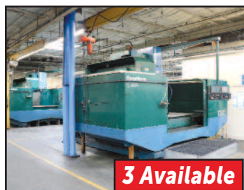
Kasuga Quantum Q-2000V VMC