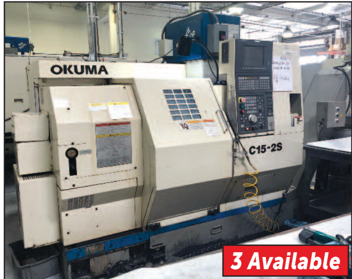
Okuma LCC15 CNC Turning Center