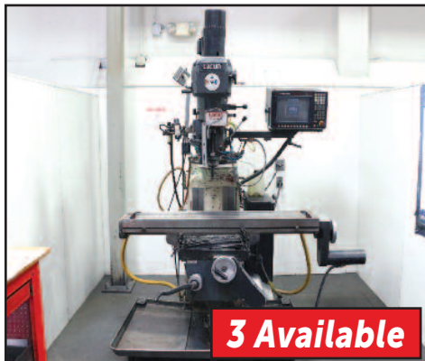
Lagun Delux 3 2-Axis CNC Mill