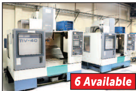
Mori Seiki MV-40 & MV-40M Vertical Machining Centers