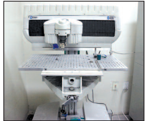
Hermes IS400 Engraver