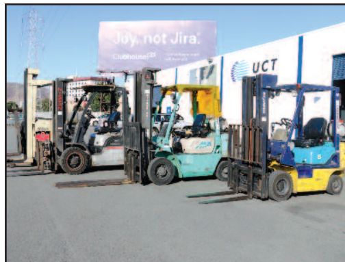
View of Forklifts