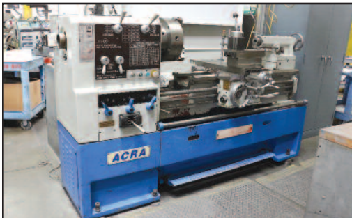
Acra Atel-2140SC Engine Lathe