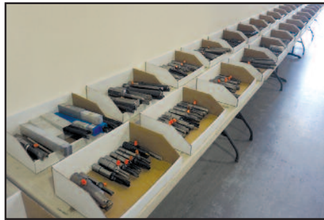
View of Inserts