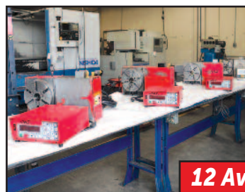
View of Haas Rotary Tables