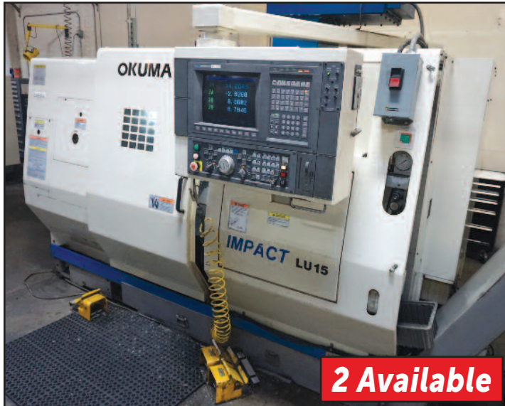
Okuma LU-15 Impact CNC Turning Center