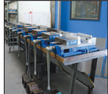
View of Kurt Vises