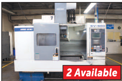
Mori-Seiki SV-500/40 Vertical Machining Center