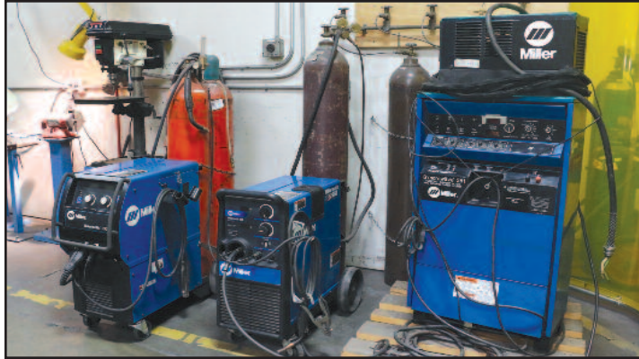
View of Miller Welders