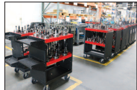
View of Tooling

TERMS AND CONDITIONS: A "Buyer's Premium" of 18% of the final hammer price shall be added to each invoice. Applicable sales tax will likewise be added to the purchase price of all taxable items. Rigging/Removal: IS THE RESPONSIBILITY OF THE BIDDER/BUYER and all riggers are required to be licensed, insured and approved, in advance, by MNA. See full Terms and Conditions on our website.