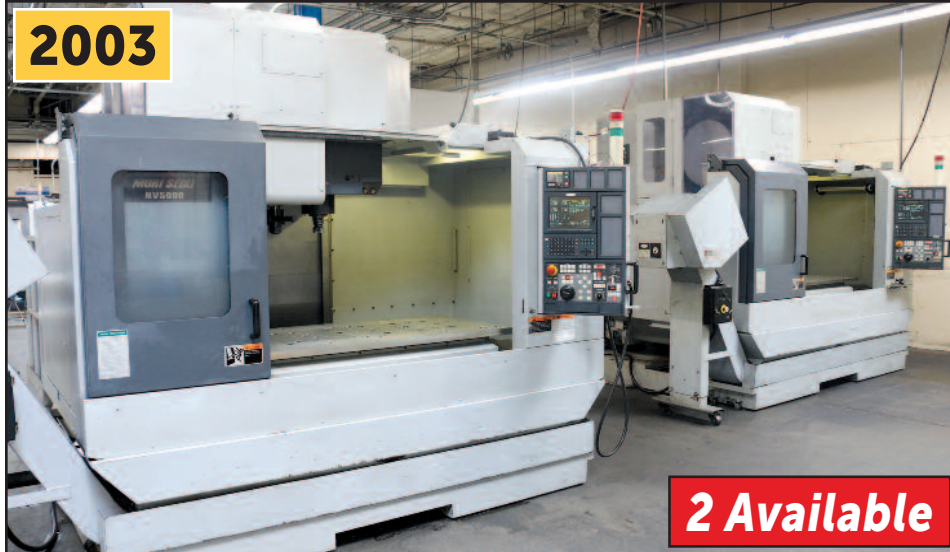
Mori-Seiki NV5000B/40 Vertical Machining Centers