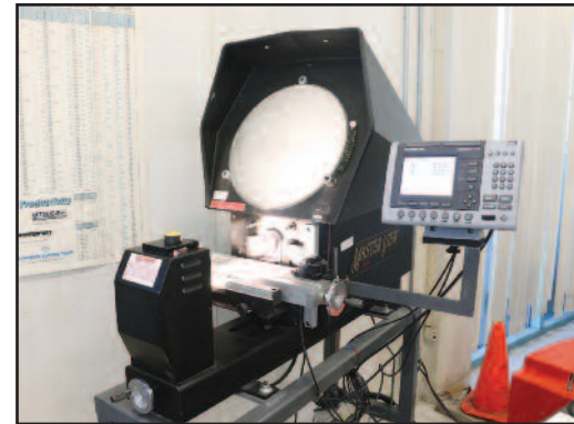
Mitutoyo Optical Comparator