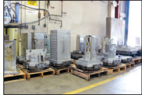
Massive Quantity of Tombstones