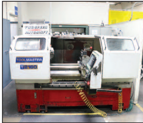
Fryer Toolmaster 2160 CNC Teach Lathe