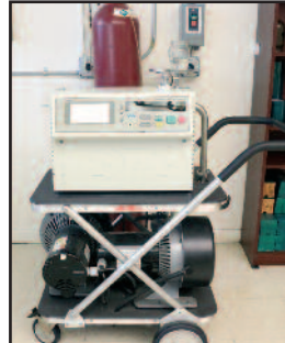
CaVarian Leak Detector