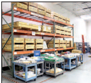
Racking & Material