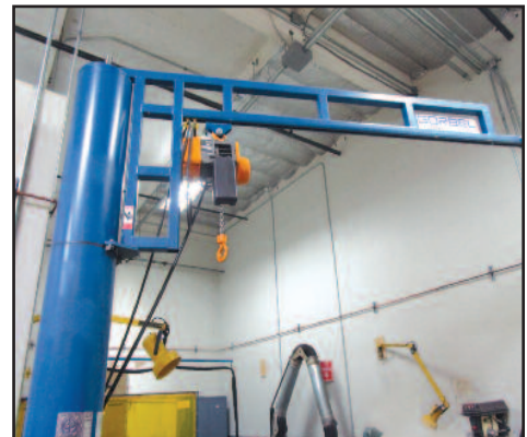
Gorbel Jib Cranes