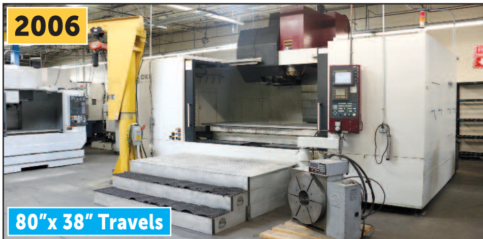
OKK VM-900 Vertical Machining Center