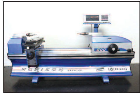
Fowler-Trimos Horizon Premium 500 SuperMic