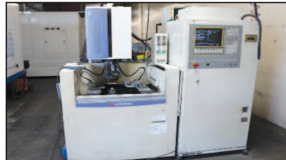
Mitsubishi FX-10K CNC Wire Type EDM