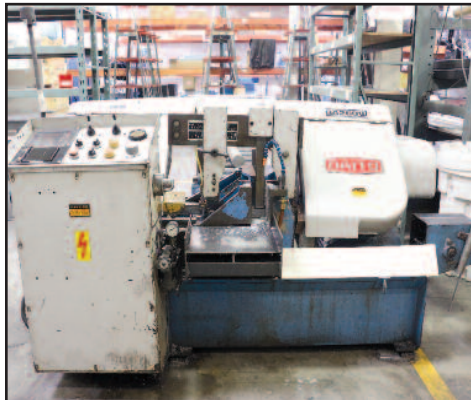
Daito Auto Horiz. Bandsaw