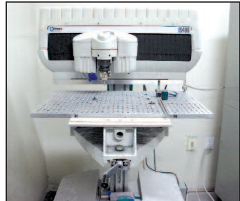
Hermes IS400 Engraver