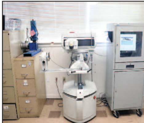
Gravo Graph IF400 Engraver