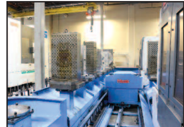
Mazak PFH-5800 , 4-Axis Palletech F.M.S., Fusion 640M Controls, (10) 20" Pallets, 15k RPM, 80 ATC, CTS, Probe, Chip Blaster