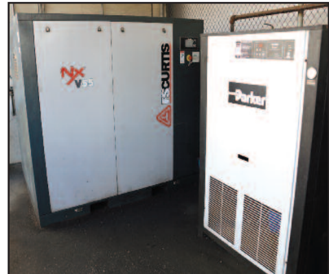
View of Air Compressors