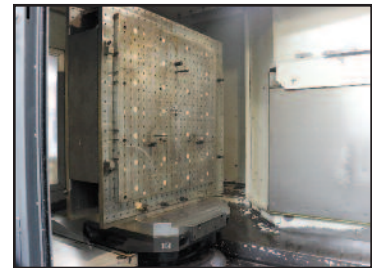
Mori-Seiki NH8000 DCG , 4-Axis, Motic MSX-7011I Control, (2) 31.5" x 31.5" Pallets, 55.1" x 47.2" x 53.1" Travels, .001 Deg. B-Axis, 40 HP, 15K RPM, HSK100 Taper, 140 ATC, Coolant thru Spindle, Chip Conveyor, S/N NH801G10153