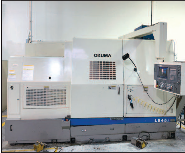
Okuma LB45 CNC Turning Center