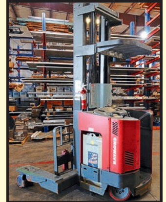
RAYMOND MDL. EASI-4D-R45DT ELECTRIC REACH TRUCK