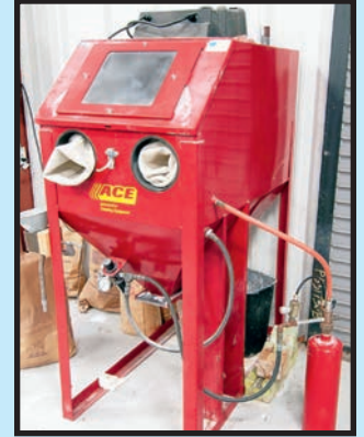
ACE 24" X 24" GLOVEBOX BEAD BLAST