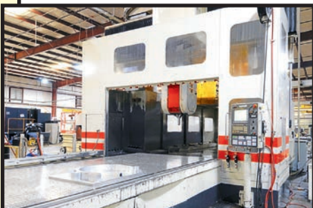
CLOSE UP VIEW OF SNK RB-200F

CINCINNATI MILACRON MDL. 30V , Siemens Acramatic 2100 CNC control, 60"W. x 130"L. tbl., 120" X, 60" Y, 29" Z-axis travels, \pm 25 deg. A and B-axis, CAT-50, 5,000 RPM, 30 HP, multi-function remote pendant.