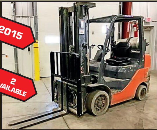
TOYOTA 6,000-LB. CAP. LPG FORKLIFT