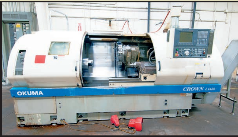
OKUMA CROWN MDL. L1420 CNC LATHE