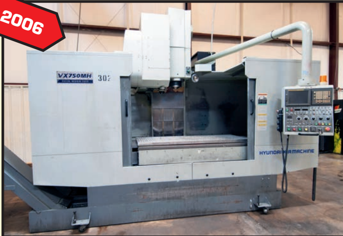
HYUNDAI-KIA MDL. VX750MH CNC VERT. MACHINING CENTER