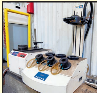
ISCAR HEAT SHRINK TOOL SYSTEM AND ETM EZ-LOCK TOOLHOLDER CLAMPING SYSTEM