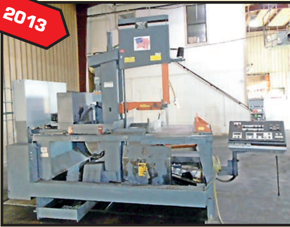
HEM MDL. V140HM-60 TILT FRAME VERT. BANDSAW