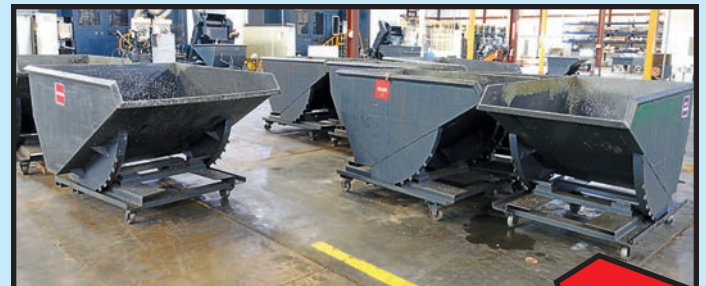
SAMPLE VIEW OF SELF DUMPING HOPPERS

On-Site Bidding in Euless, Texas or Bid Via Webcast at BidSpotter.com