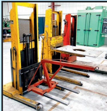
BIG JOE ELECTRIC DIE LIFTS