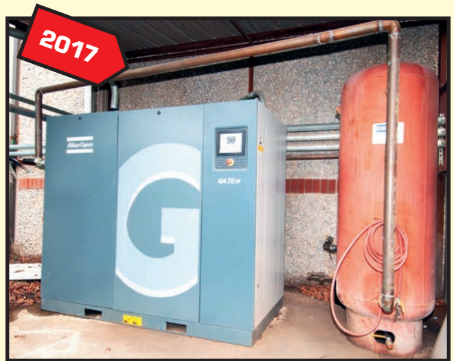
ATLAS COPCO 100 HP ROTARY SCREW AIR COMPRESSOR

GENIE MDL. GS-1930 , 500-lb. platform cap., extendable pulpit, (4) controls, 291 H.O.M., S/N N.A.