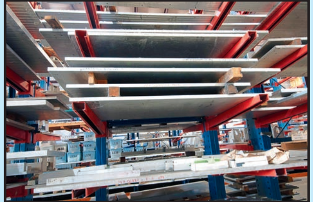
SAMPLE VIEW OF RAW MATERIAL