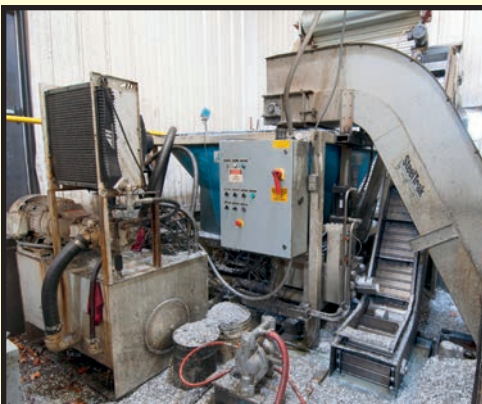
APPLIED RECOVERY SYSTEMS ALUMINUM PUCKMASTER