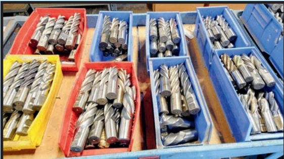
SAMPLE VIEW OF ENDMILLS

At the Premises of H.M. DUNN COMPANY 3301 HOUSE ANDERSON RD., EULESS, TEXAS 76040 Wearing Masks & Social Distancing Are Required