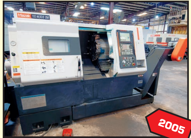
MAZAK MDL. QUICK TURN NEXUS 250 CNC LATHE