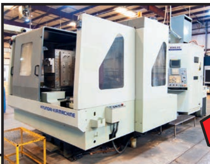
HYUNDAI-KIA MDL. KH63G

HYUNDAI-KIA MDL. KH63G , new 2006, Fanuc Series 18i-MB CNC control, 25" x 25" pallet size, 360 deg. tbl. indexing, 2,200-lb. tbl. load, 37.4" X-axis travel, 32.5" Y-axis travel, 30" Z-axis travel, CAT-50 spdl. taper, spds.: 20–4,500 RPM, 30 HP spdl. drive motor, 60-pos. ATC, CoolJet hi-pressure thru spdl. coolant system, S/N KH630416.