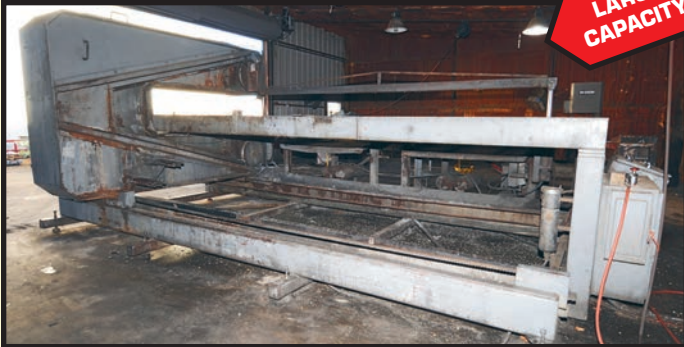
CUSTOM ALUMINUM VERT. PLATE SAW