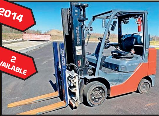
TOYOTA 7,000-LB. CAP. LPG FORKLIFT