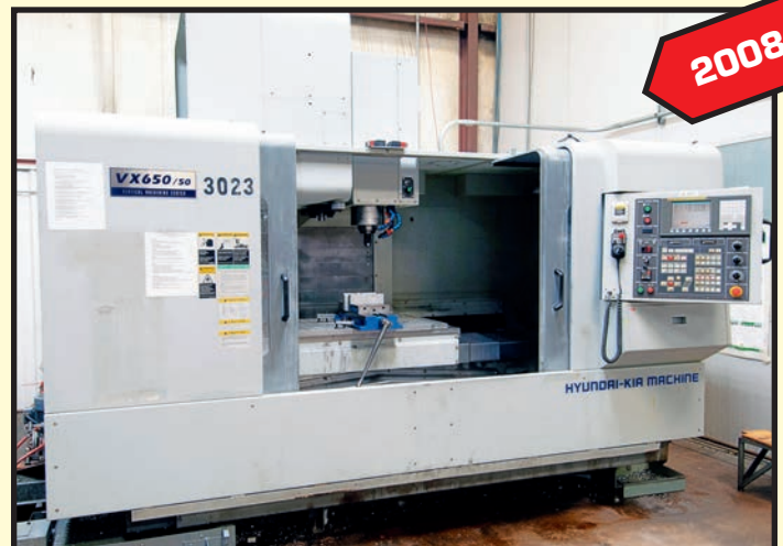
HYUNDAI-KIA MDL. VX650/50 CNC VERT. MACHINING CENTER