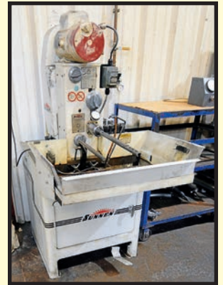
K.O. LEE MDL. B8900 TOOL CUTTER AND GRINDER