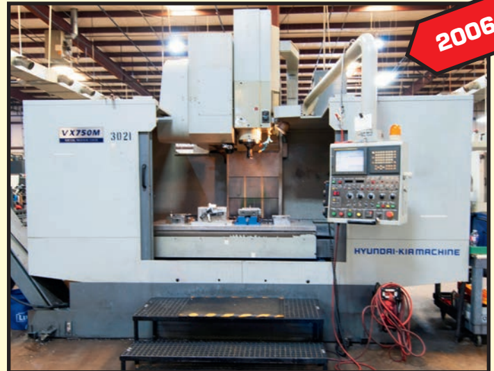
HYUNDAI-KIA MDL. VX750M CNC VERT. MACHINING CENTER