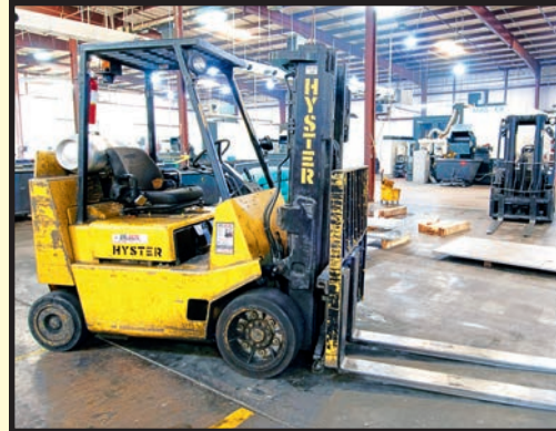
HYSTER 8,000-LB. CAP. LPG FORKLIFT