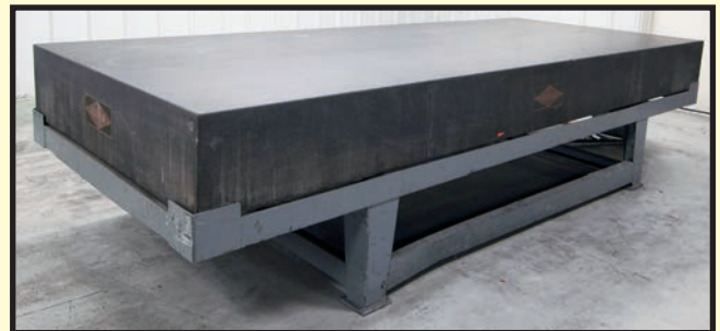
SAMPLE VIEW OF GRANITE SURFACE PLATES