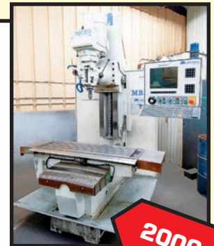
MILLTRONICS MDL. MB20