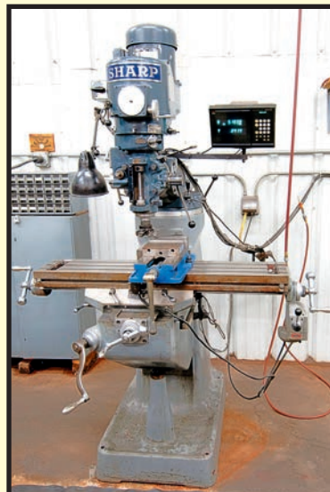
SHARP VERT. TURRET MILLING MACHINE