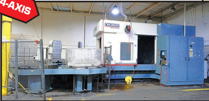
CINCINNATI MAGNUM MDL. 100 4- AXIS