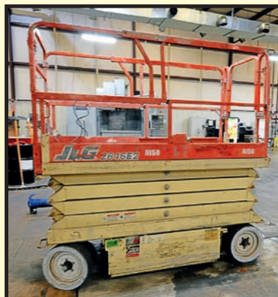
JLG MDL. 2646E2 SCISSOR LIFT