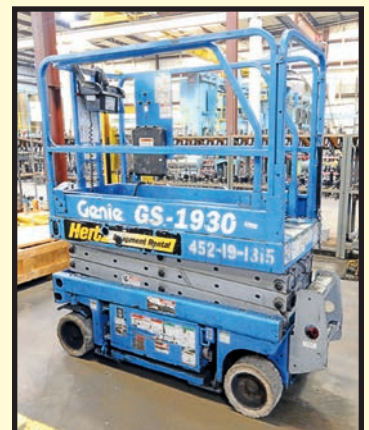
GENIE MDL. GS-1930 SCISSOR LIFT