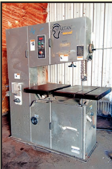
MARVEL SPARTAN MDL. S36V VERT. BANDSAW

COSEN AUTOMATIC HORIZONTAL BANDSAW , 12" dia. cap., auto. feed.