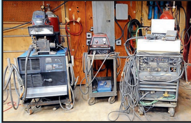
SAMPLE VIEW OF LINCOLN AND MILLER WELDING AND CUTTING MACHINES