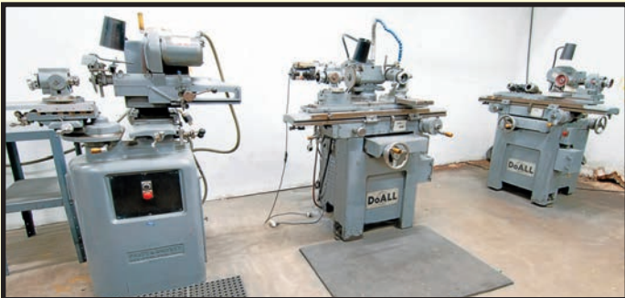
PARTIAL VIEW OF TOOL CUTTER AND GRINDER