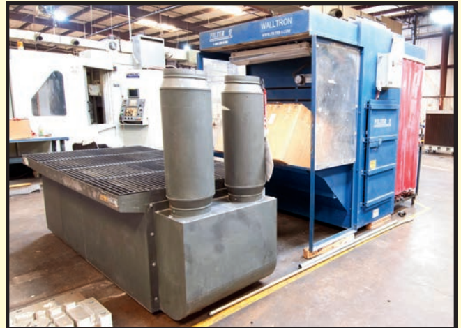
DIVERSITECH DOWNDRAFT TABLE AND FILTER 1 WALTRON FILTER WALL