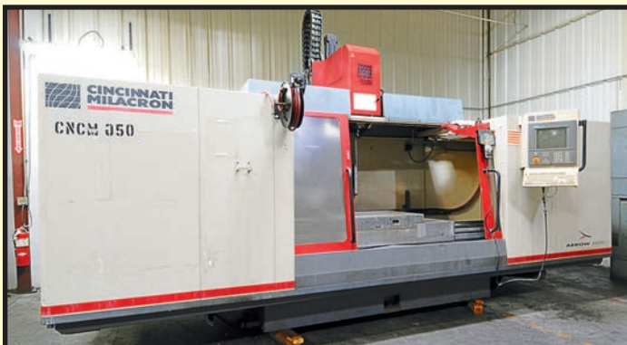
CINCINNATI MILACRON MDL. ARROW 2000 CNC VERT. MACHINING CENTER

CINCINNATI MILACRON MDL. SABER 2000 4-AXIS , Siemens Acramatic 2100 CNC control retrofit, 30" x 90" tbl., 6,615-lb. tbl. load, 80" X, 30" Y, 30" Z-axis travels, CAT-40, 8,000 RPM, 15 HP, 20 ATC, drilled and tapped sub-plate, S/N 7044A0B970082.