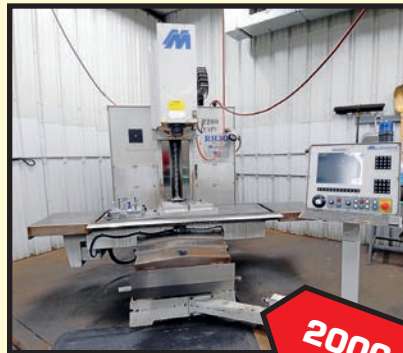
MILLTRONICS MDL. RH30