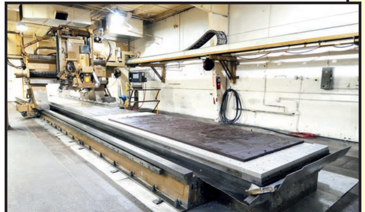
CINCINNATI MILACRON MDL. 30V RAIL