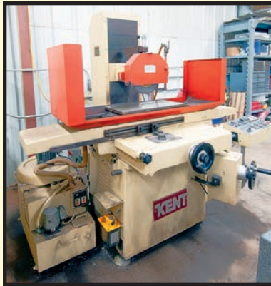
KENT 12" X 24" MDL. KGS-306AHD SURFACE GRINDER