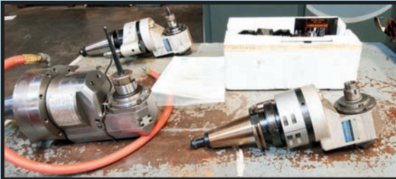
SAMPLE VIEW OF CAT-50 RIGHT ANGLE HEADS