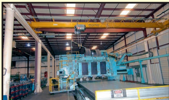
PROSERV ANCHOR 5 T. X 39'-6" FREE STANDING BRIDGE CRANE SYSTEM

PNEU. NAIL GUNS; BATTERY OPERATED DRILLS AND SAWS; RIGHT ANGLE GRINDERS; MILWAUKEE SAWZ-ALL; BOSCH HAMMER DRILL; MILWAUKEE MAGNETIC BASE DRILL; 1" DRIVE HEAVY DUTY SOCKET SET; TAP AND DIE SETS; RIDGID PIPE WRENCHES up to 36"; RIDGID PIPE THREADERS; HAND PIPE THREADERS up to 2"; RIDGID TRI-STAND; PRTO TORQUE WRENCH; HUSKY TORQUE WRENCHES; UTICA TORQUE WRENCH; MORE.