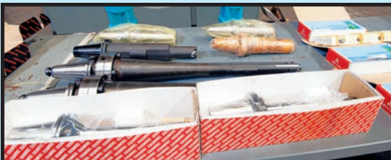
JEWELL GROUP EXTENDED BORING TOOLS