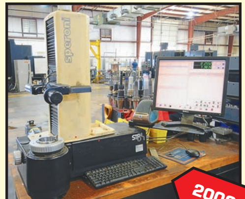
SPERONI MDL. STP34 TOOL PRESETTER