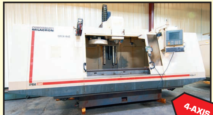
CINCINNATI MILACRON MDL. SABER 2000 4-AXIS CNC VERT. MACHINING CENTER