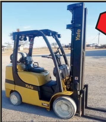
YALE 7,000-LB. CAP. LPG FORKLIFT