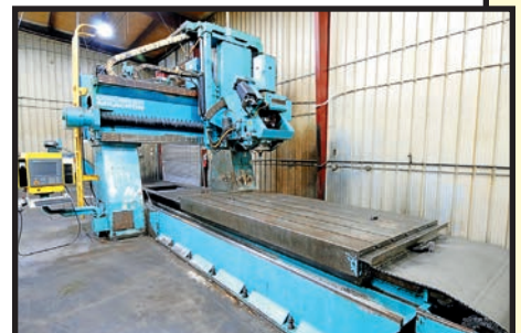
CINCINNATI MILACRON MDL. 30V