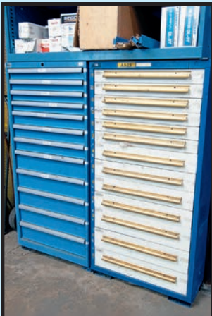
SAMPLE VIEW OF ROLLER DRAWER TOOL CABINETS