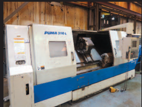
Daewoo Puma 350LB CNC Turning Center

ONSITE INSPECTION: Wednesday, March 6, from 10:00am to 3:00pm CST ONLINE AUCTION DATE: Thursday, March 7 at 11:00am CST INSPECTION LOCATION: 905 S. Grandview Avenue, Odessa, TX 79761