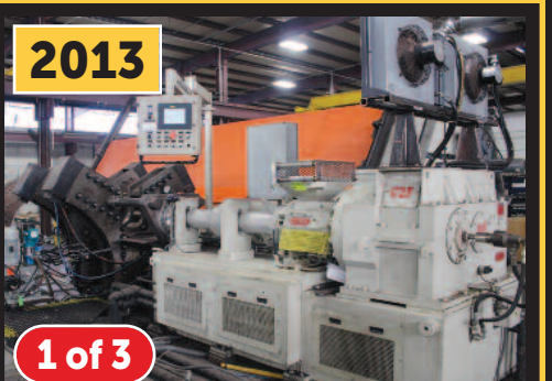
Cope EPT-12016 Extruder for Mud Motor Industry

SEE WEBSITE FOR TERMS & CONDITIONS - 18% buyer's premium will apply.