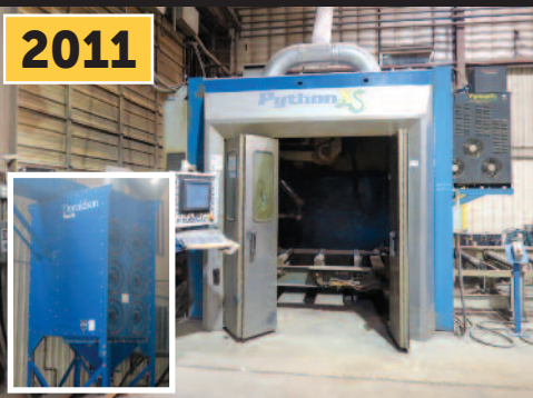
Burlington Python XS CNC Plasma Beam Coping Machine