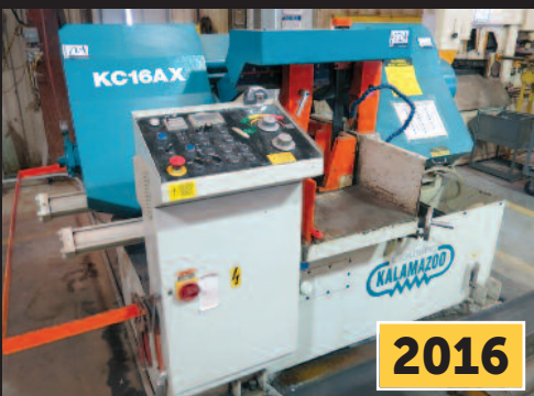
Clausing Kalamazoo Bandsaw