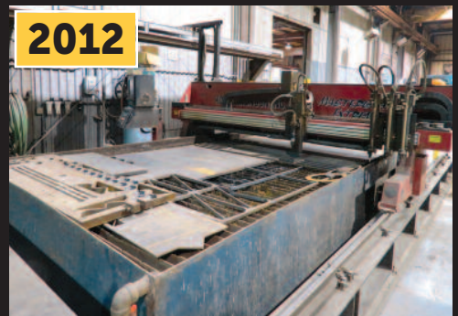
Koike Anderson Mastergraph MCMX 3000 CNC Plasma Cutting Table