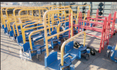
Variety of Shop Carts