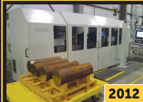
DTI FC300CNC CNC Facing and Centering Machine