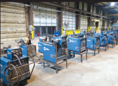
View of Welders