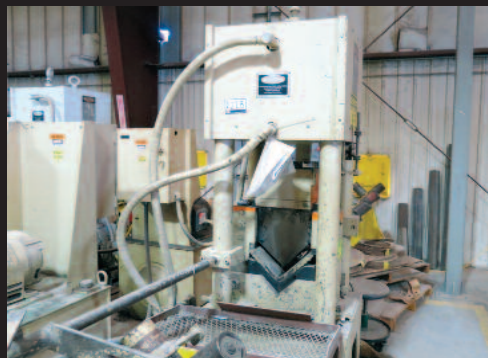
Buffalo Forge Hydraulic Angle Shear