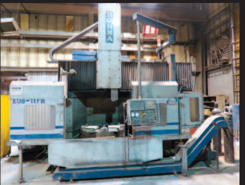
43" Homma EOS 11FH CNC VBM