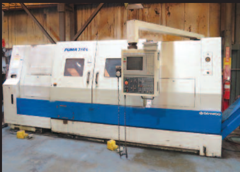
Doosan Puma 350LB Turning Center, Mits Control, 37.5" Sw x 83" Centers