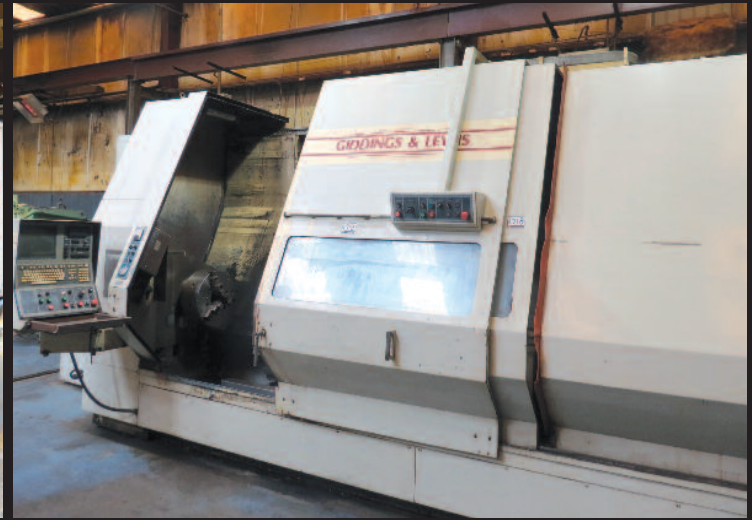
Giddings & Lewis 18U Turning Center, 32" Swing x 120" Centers