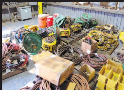
View of Hose Reels