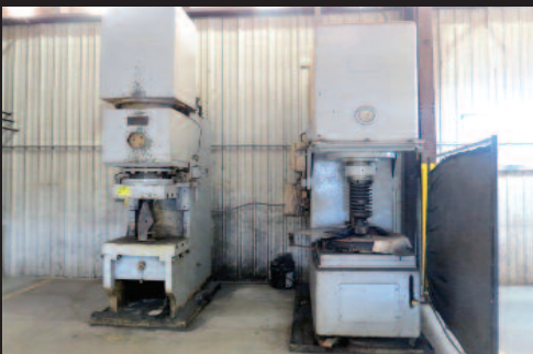
View of Presses