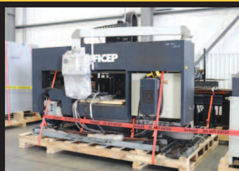
Ficep 1102 DZTT CNC Beam Drilling and Coping Line