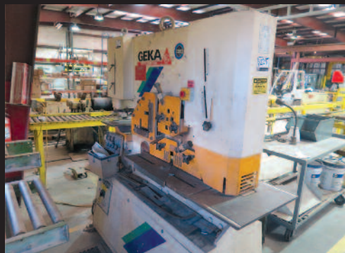
Geka Hydraulic 110/A Iron Worker