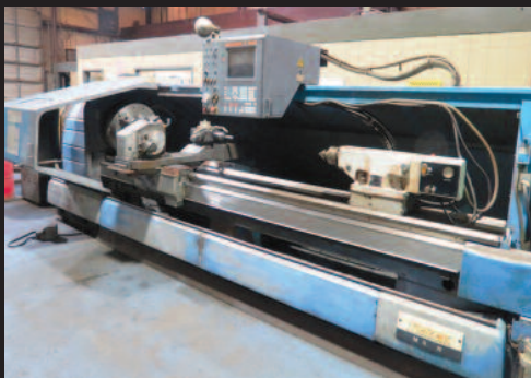
Mazak M5N-3000 Turning Center, T-Plus Control, 9" Spindle Bore, 120" Centers