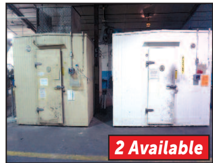
View of Walk-in Freezers