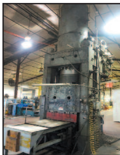
1000-Ton Hyd. Forming Press