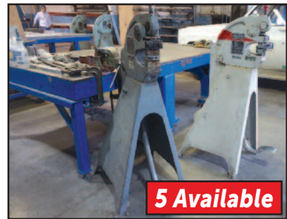
Marchant 6FG Shrinker/Stretchers