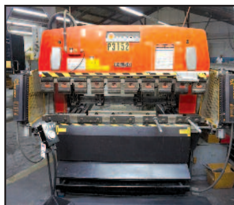
Amada RG-50 CNC Press Brake