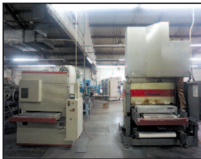
View of Timesavers