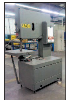
Grob Vert. Band Saw