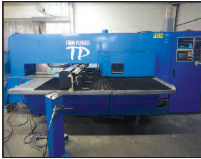
FinnPower TP 2520 CNC Turret Punch