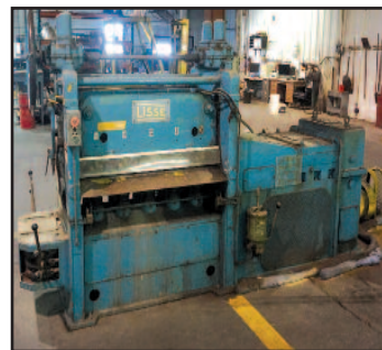
Lisse 23/30 Rolling Mill