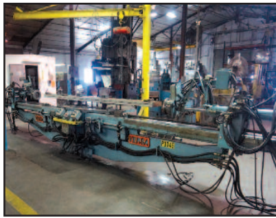
17-Ton Versa Stretch Former