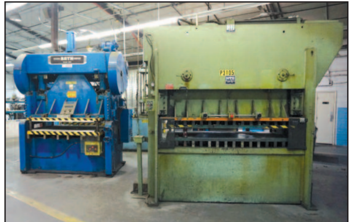
View of Press Brakes