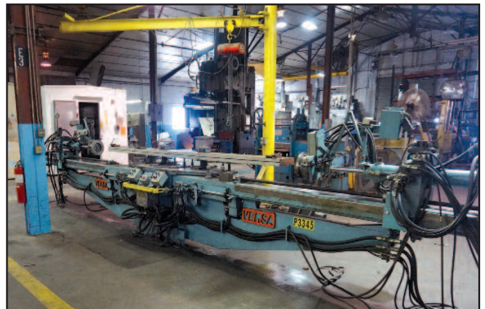
17-Ton Versa Stretchformer

ONSITE & ONLINE AUCTION: Tuesday, November 12th @ 10:00am CST ONSITE INSPECTION IN BOTH LOCATIONS: Monday, November 11th, 9am to 4pm CST