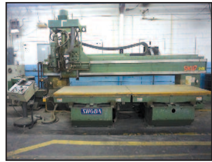
Shoda NCW516-1352 CNC Router