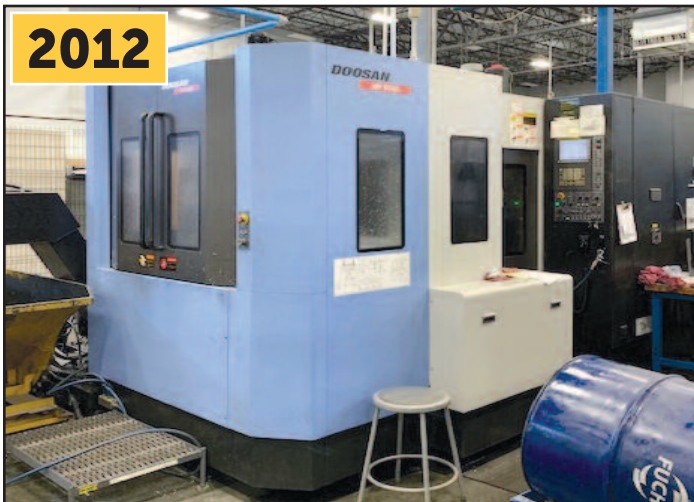
Doosan HM5000 4-Axis HMC