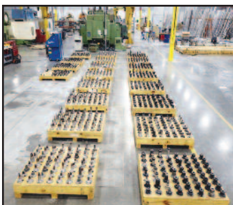
View of Tooling