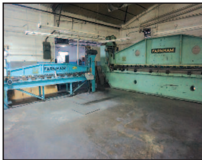
View of Farnham Sheet Bending Rolls