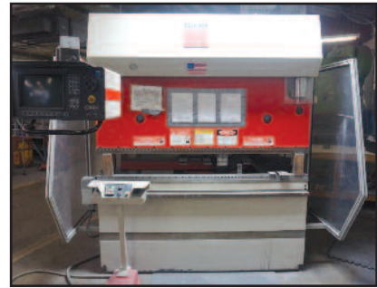
85-Ton x 80" Trumpf Trumabend CNC Press Brake