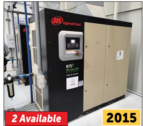
IR 100 HP Compressor