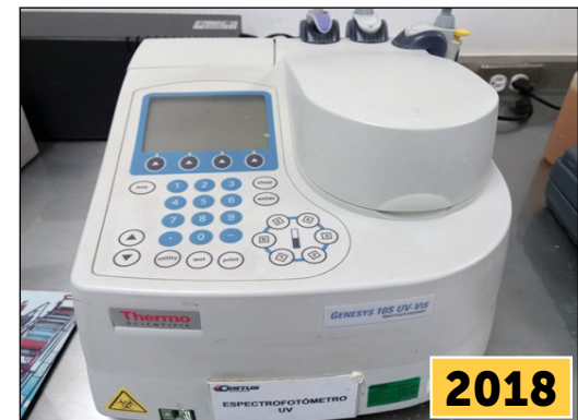
Thermo Scientific Spectrophotometer