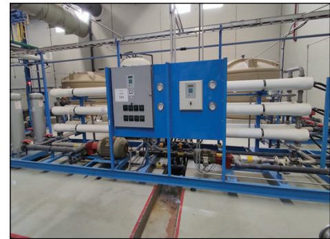
Reverse Osmosis System