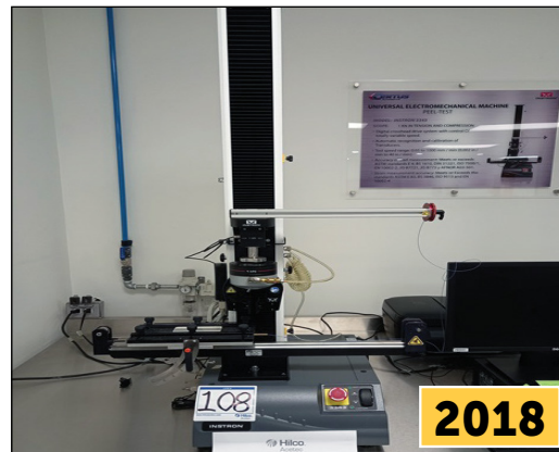
1 kN (225 Lb) Instron 3343 Universal Test Machine