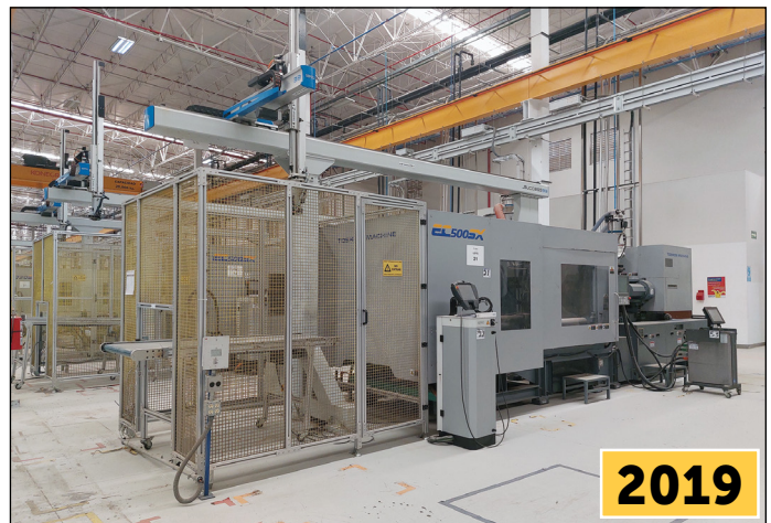
500 US Ton 31.9 oz Toshiba Injection Molder