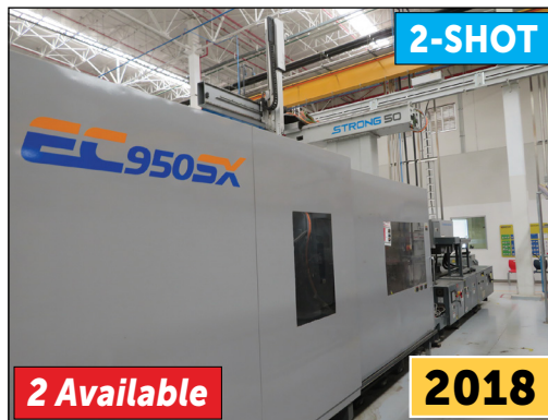
935 US Ton Toshiba 2-Shot Electric Injection Molders