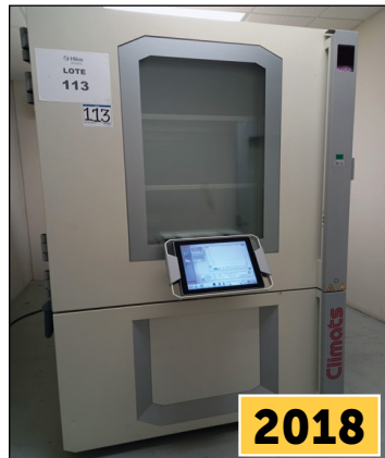
Climats Climate Chamber