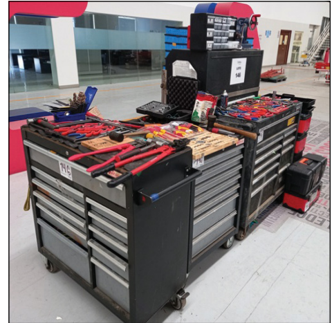
Manual Tooling Lot