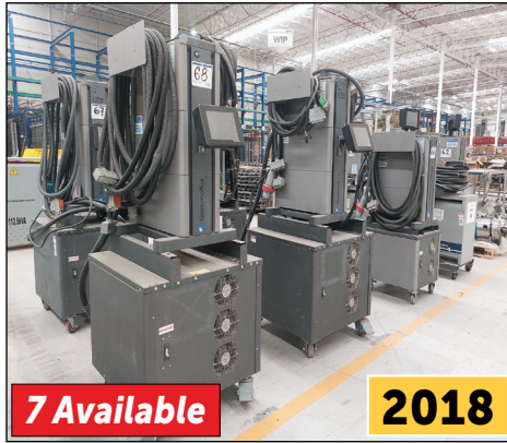
Gammaflux Hot Runner Controllers