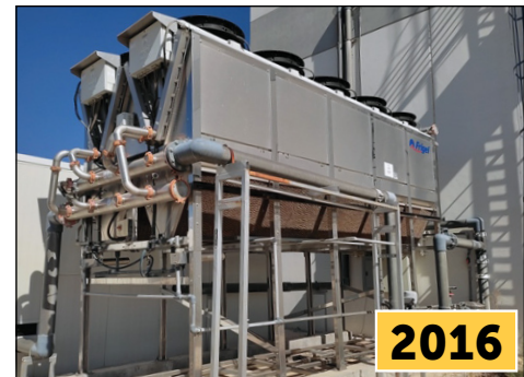
Frigel Ecodry Cooling Tower