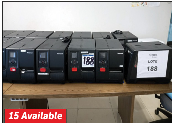
Honeywell PM 4220000 Thermic Printers