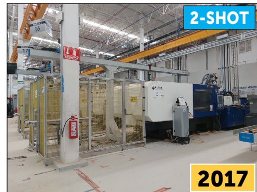
595 US Ton 10.2 oz/ 34.2 oz Haitian Injection Molder