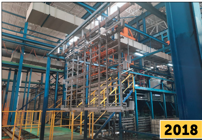
View of Chrome Plating Line

HUGE SCRAP OPPORTUNITY TO PURCHASE: 20 TONS OF COPPER+BUSS, 20 TONS OF NICKEL, 7 TONS OF TITANIUM