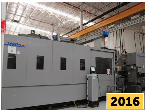
1,430 US Ton 140 oz Toshiba Injection Molder