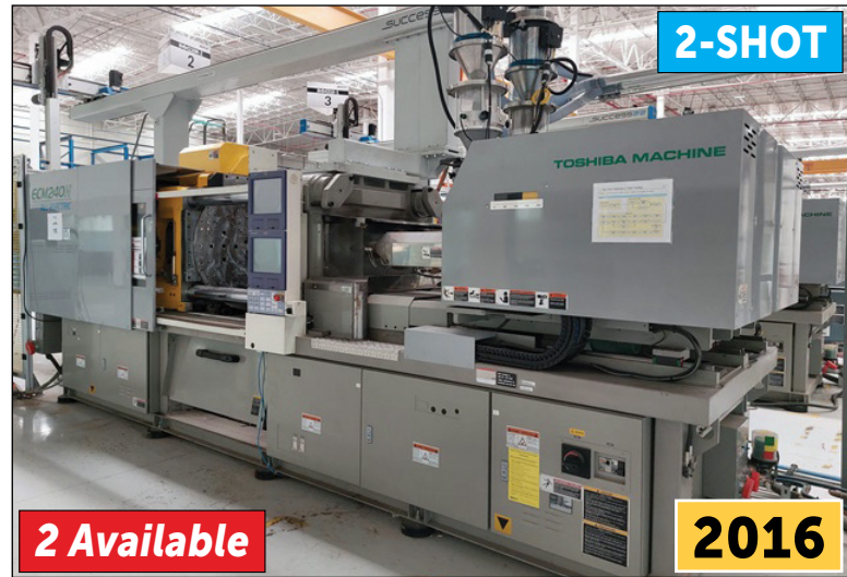
240 US Ton 3.7 oz / 4.7 oz Toshiba Injection Molders