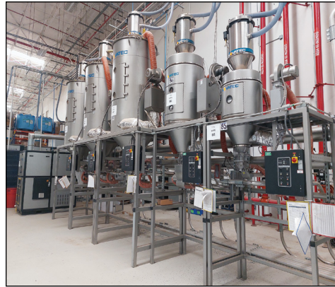
Novatec Central Drying Systems