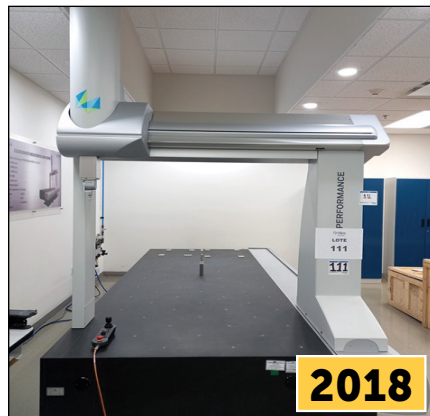
Hexagon Global Performance CMM