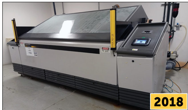
Atlas Material Testing Ametec Corrosion Cabinet