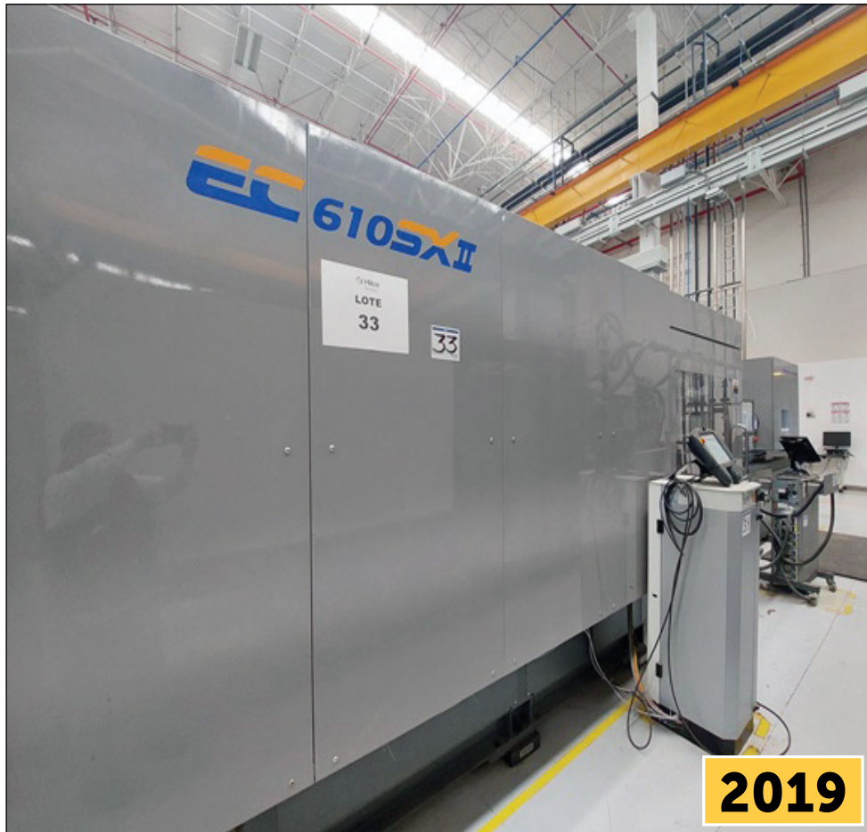
610 US Ton 31.9 oz Toshiba Injection Molder