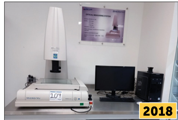
Micro Vu Optical Measuring System