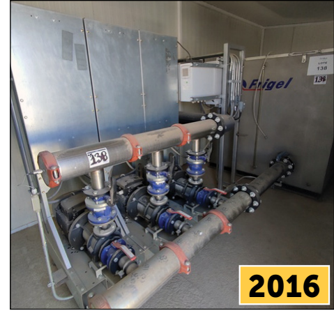
Frigel Cool Water Recirculation Pumping Station