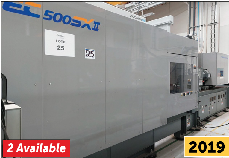
500 US Ton 31.9 oz Toshiba Electric Injection Molder