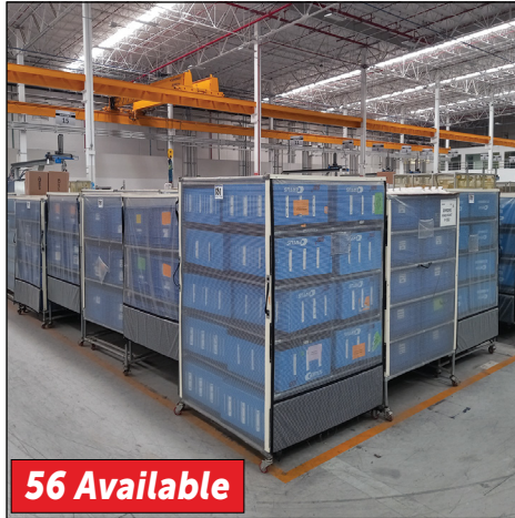
Storage Mobile Cars, Different Sizes