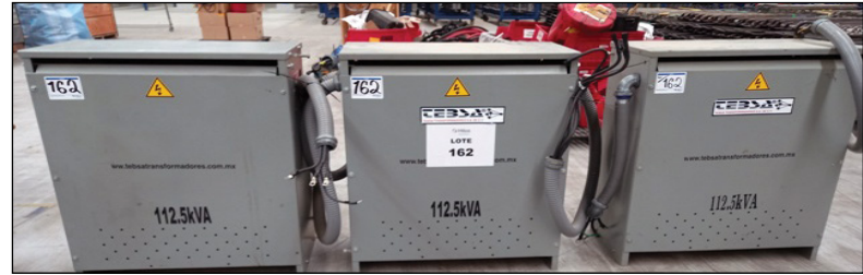
View of Electrical Transformer