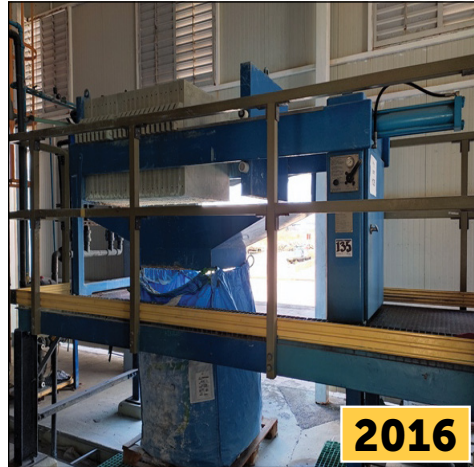
10 FT3 630 MM ACS Medio Ambiente Press Filter