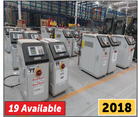
Frigel Temperature Controllers