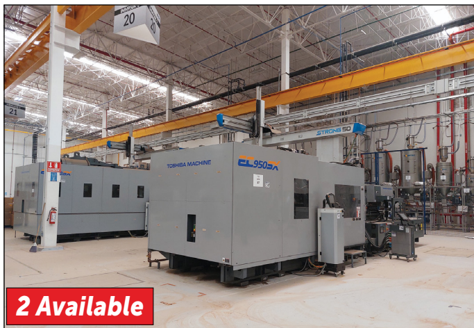
935 US Ton Toshiba 2-Shot Electric Injection Molders