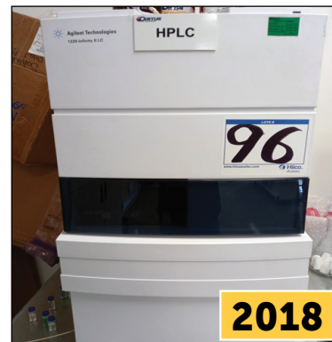
Agilent Technologies Spectrophotometer