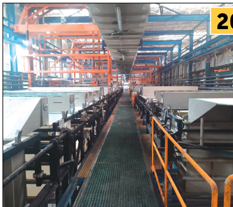
Views of Chrome Plating Line