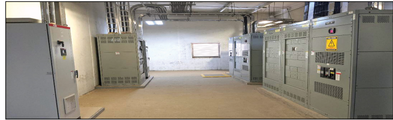
View of Switch Gear