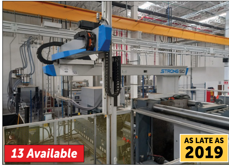
Sepro Full Servo Robot