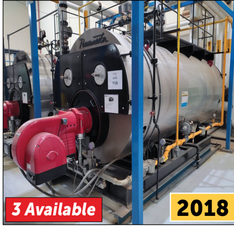
Powermaster WB-2A-3P-HW (FMG) Boiler