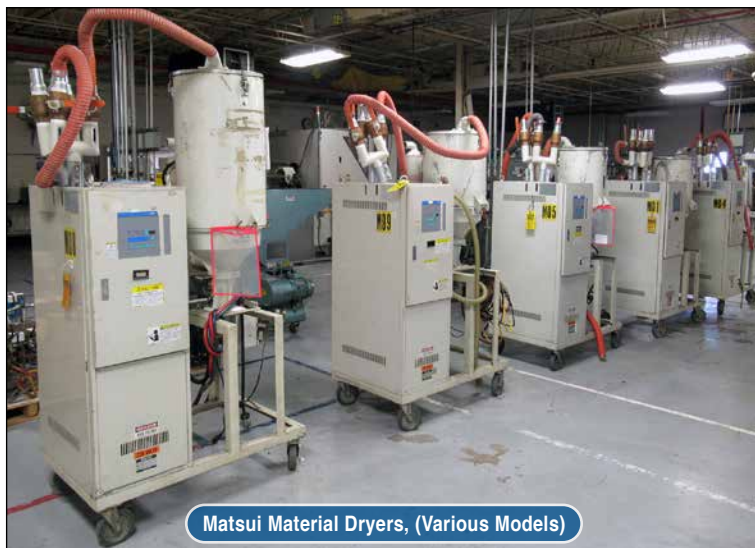
Matsui Material Dryers, (Various Models)