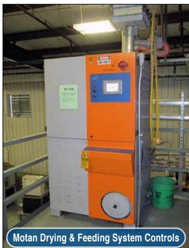
Motan Drying & Feeding System Controls