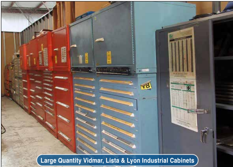
Large Quantity Vidmar, Lista & Lyon Industrial Cabinets