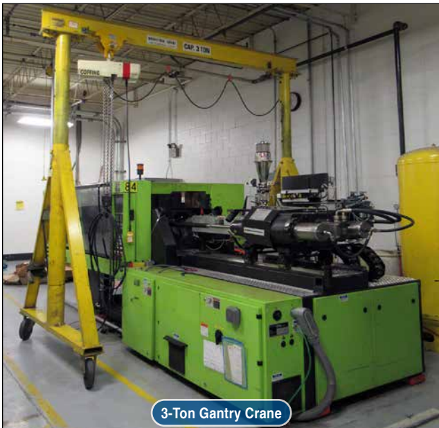
3-Ton Gantry Crane