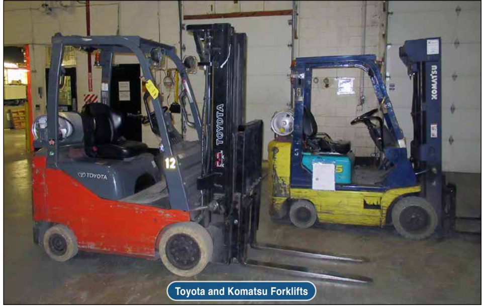
Toyota and Komatsu Forklifts

(2) KAESER ASD40T ROTARY SCREW AIR COMPRESSORS, 40HP