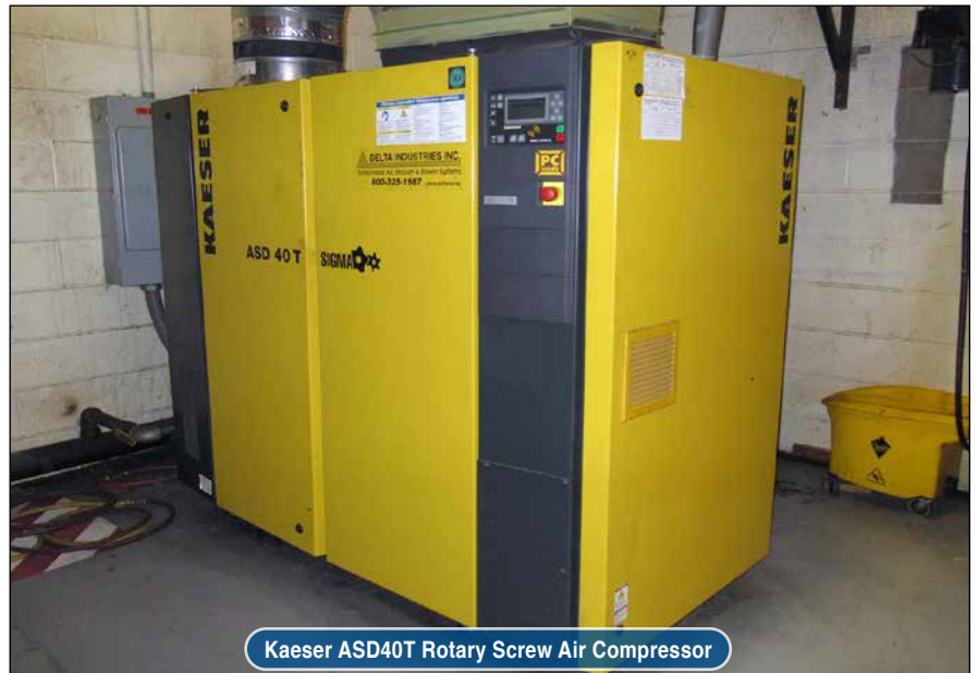
Kaeser ASD40T Rotary Screw Air Compressor