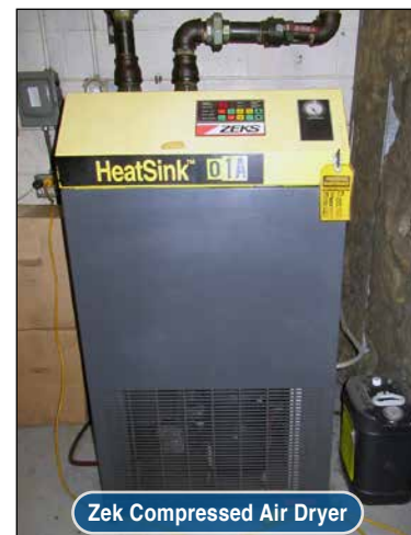
Zek Compressed Air Dryer

VISIT WEBSITE AND BIDSPOTTER FOR COMPLETE SPECS, THE AUCTION IS UP: BidSpotter