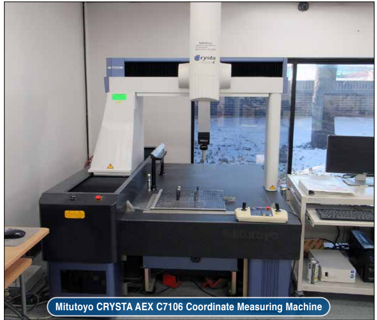
Mitutoyo CRYSTA AEX C7106 Coordinate Measuring Machine