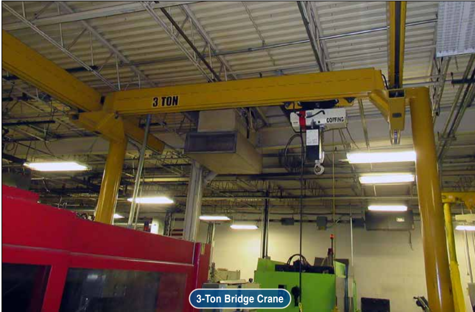
3-Ton Bridge Crane