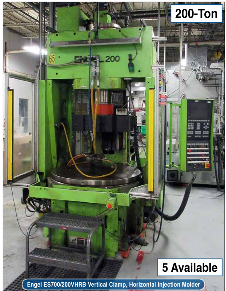
Engel ES700/200VHRB Vertical Clamp, Horizontal Injection Molder

VISIT WEBSITE AND BIDSPOTTER FOR COMPLETE SPECS, THE AUCTION IS UP: BidSpotter