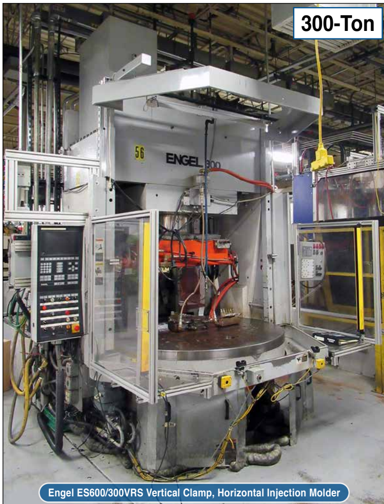
Engel ES600/300VRS Vertical Clamp, Horizontal Injection Molder

ASSET LOCATION: 460 Second Street, Elgin, IL 60123