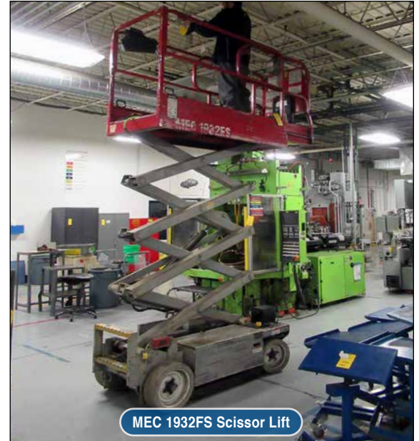
MEC 1932FS Scissor Lift