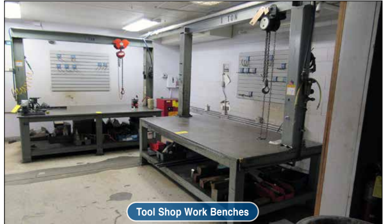
Tool Shop Work Benches