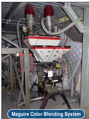
Maguire Color Blending System