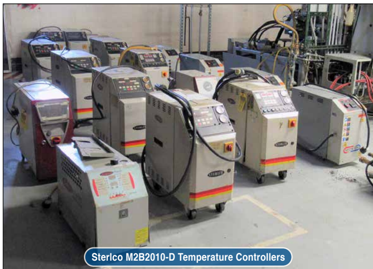
Sterlco M2B2010-D Temperature Controllers