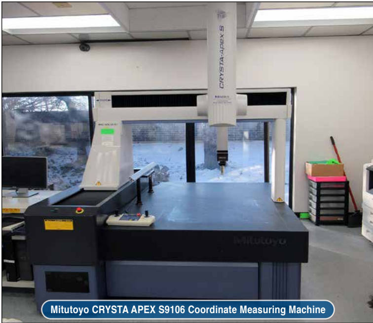
Mitutoyo CRYSTA APEX S9106 Coordinate Measuring Machine

MITUTOYO CRYSTA APEX C7106 COORDINATE MEASURING MACHINE MISCELLANEOUS LAB EQUIPMENT LARGE QUANTITY VIDMAR, LISTA & LYON INDUSTRIAL CABINETS LARGE QUANTITY OF PALLET RACKING