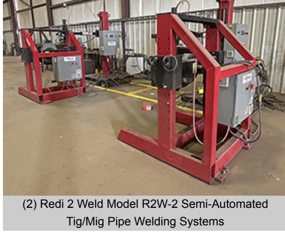
(2) Redi 2 Weld Model R2W-2 Semi-Automated Tig/Mig Pipe Welding Systems