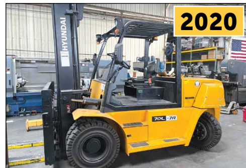
Hyundai 70L-7A Forklift, 15,000 Lb. Capacity