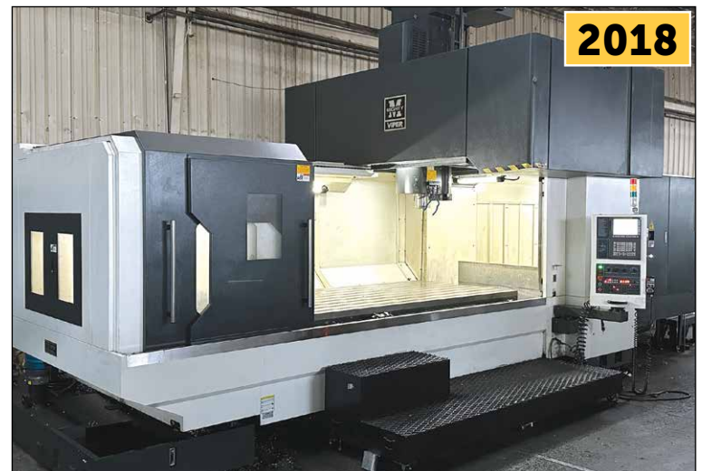
Mighty Viper PMC-3116AG CNC Bridge Mill

FOR TERMS, REMOVAL AND ADDITIONAL INFORMATION, go to: machinerynetworkauctions.com