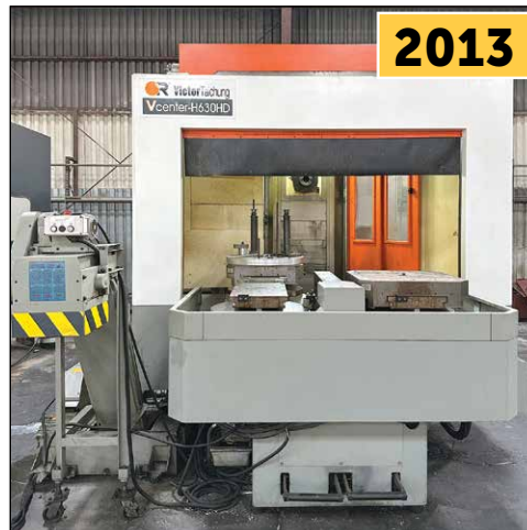
Victor Taichung VH-630HD CNC HMC