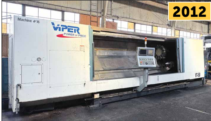
Mighty Viper VT-50AX/4000 CNC Turning Center