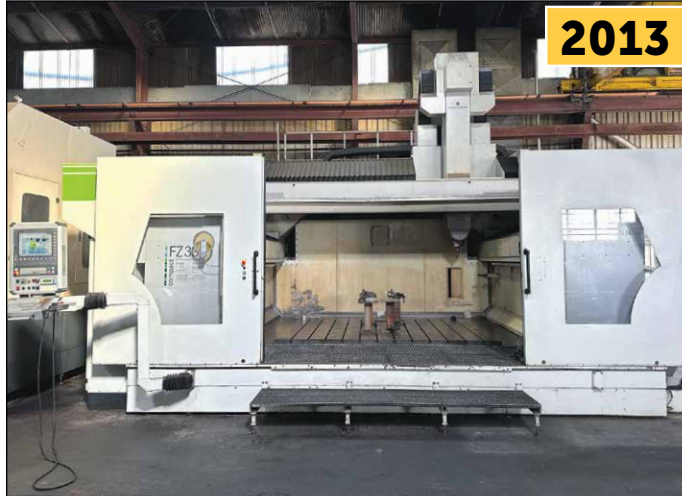
Zimmermann FZ-33 5 Axis Portal Milling Machine

FEATURING: Zimmermann 5-Axis Portal Milling Machine, Hyundai Wia & Mighty Viper CNC Vertical & Horizontal Boring Mills, Mighty Viper & Mori Seiki Bridge Mills, Mori Seiki & Mighty Viper CNC Turning, Flow Waterjet, and Hexagon CMM