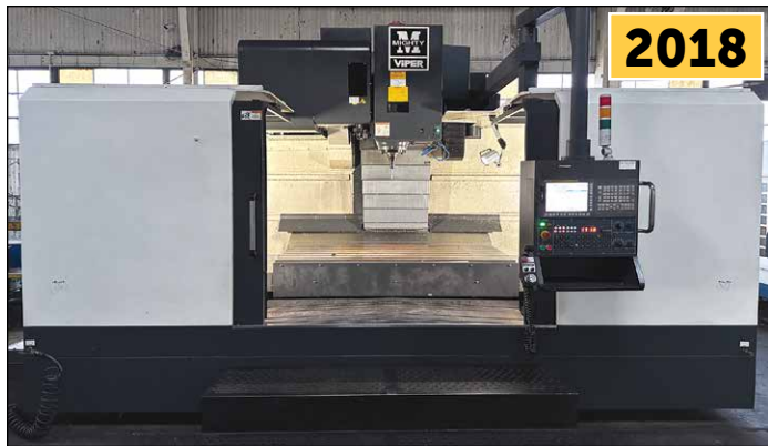
Mighty Viper VMC-1688AG CNC Vertical Machining Center