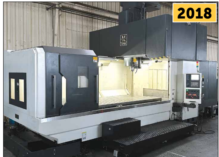
Mighty Viper PMC-3116AG CNC Bridge Mill