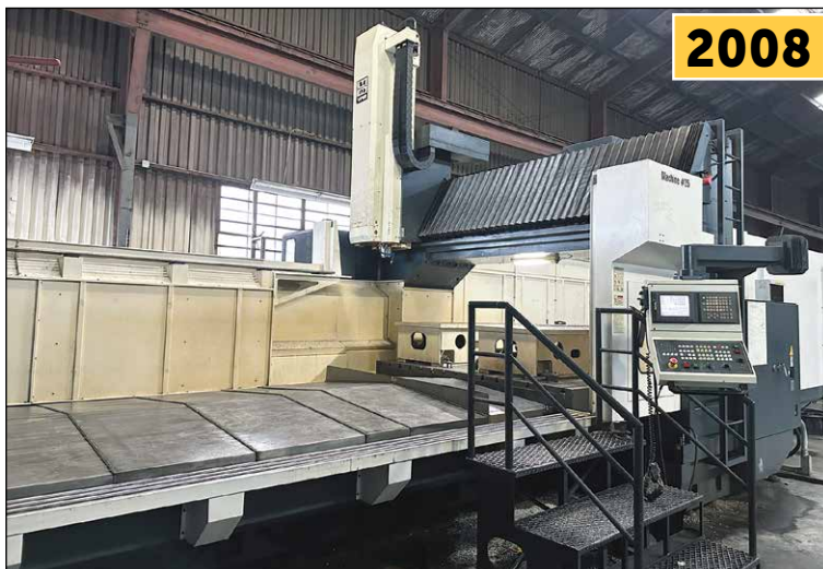
Mighty Viper PRW-5340 CNC Bridge Mill