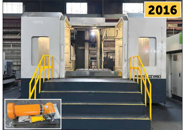
5.3" Might Viper PBM-135 CNC Table Type Horizontal Boring Mill