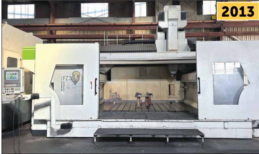
Zimmermann FZ-33 5 Axis Portal Milling Machine