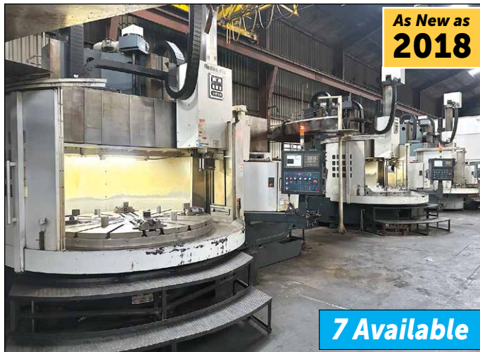
View of Mighty Viper CNC Boring Mills