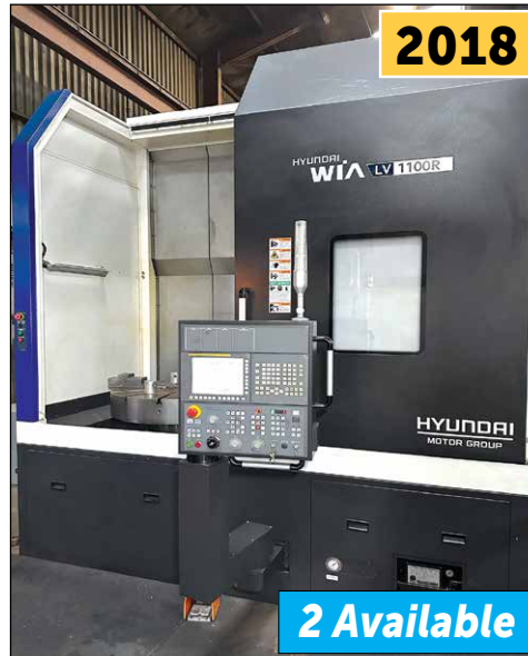
39" Hyundai Wia LV-110R CNC Vertical Boring Mill