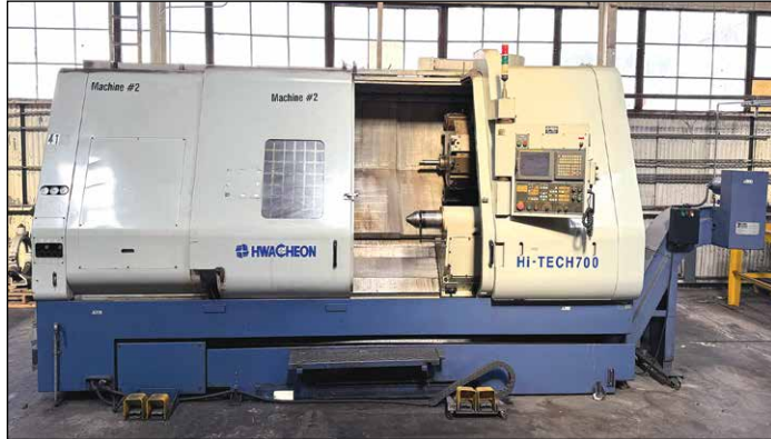
Mori Seiki SL-65A CNC Turning Center