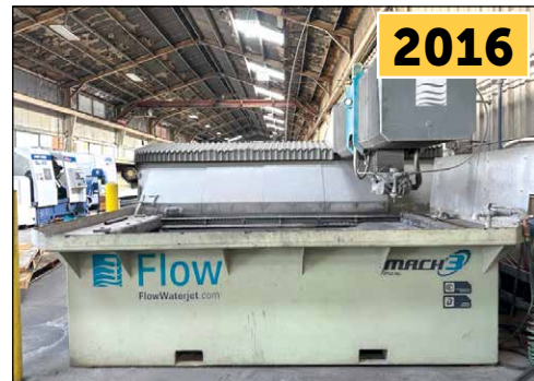
Flow Mach 3-2613 Waterjet