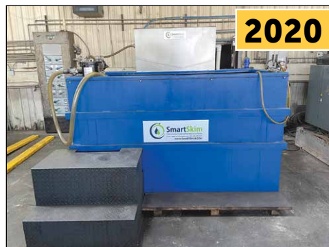
SmartSkim Coolant Loop Recycling System