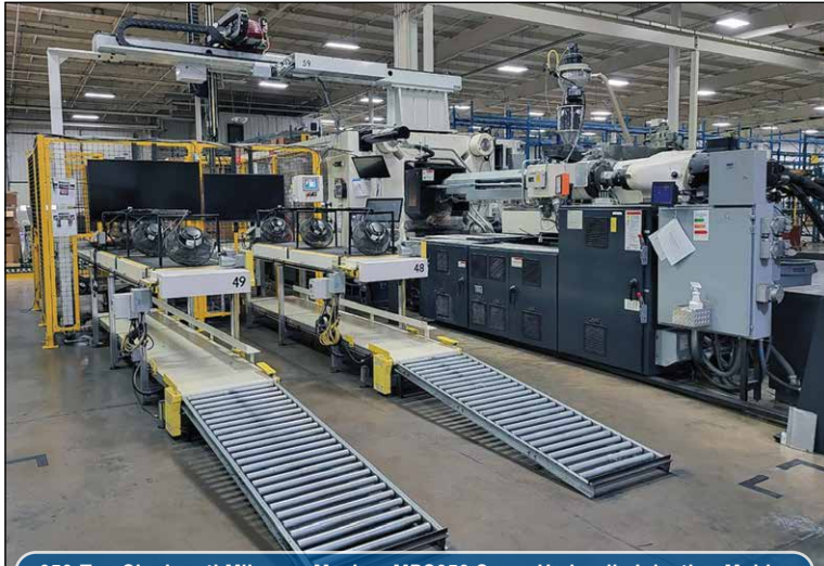
950-Ton Cincinnati Milacron Maxima MPS950 Servo Hydraulic Injection Molder