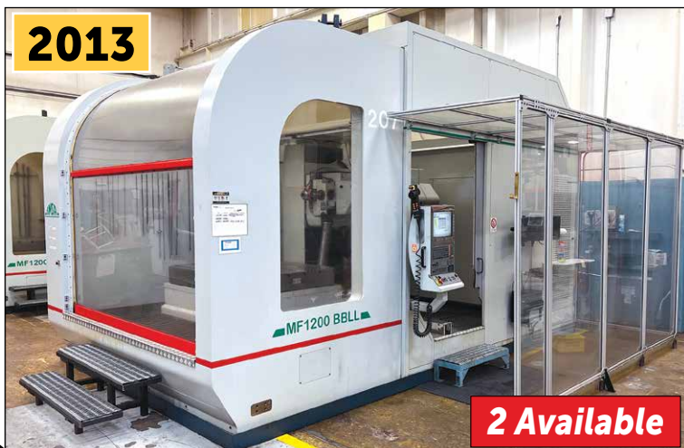
IMSA MF1200BLL CNC Horizontal Gun Drill