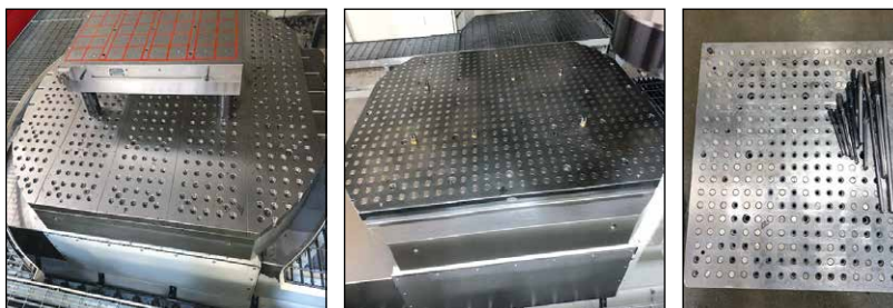
View of FPT Plates

5 3/4" x 39" • 5 1/2" x 39" • 6 1/2" x 21 1/2" • 6 1/2" x 23 1/2" • 15 1/2" x 59" 21 1/2" x 21 1/2" • 31 1/2" x 31 1/2" • 39" x 39"