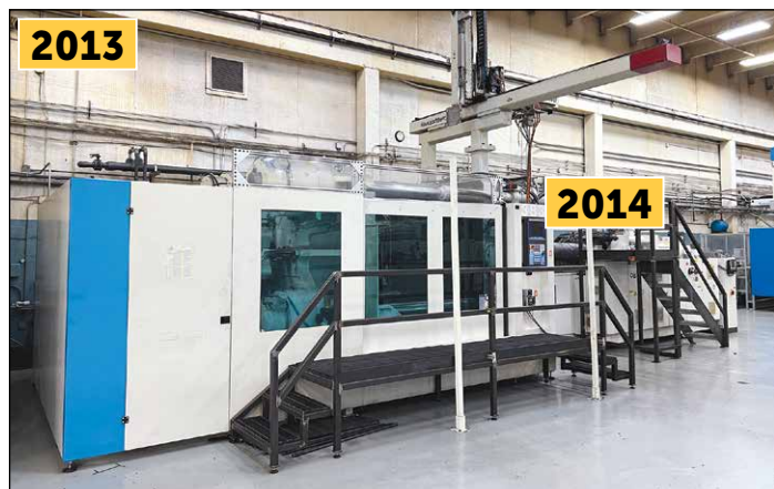
Krauss Maffei Blue Power MX 1300-8100 CNC Hydraulic Injection Molder