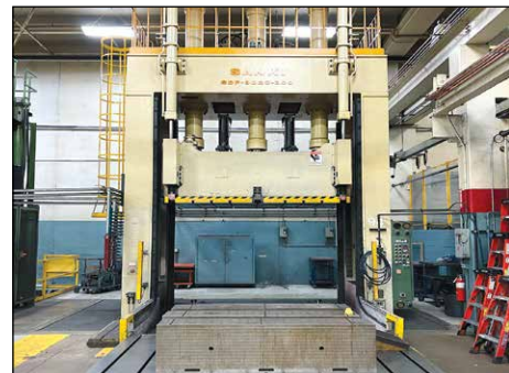
Sanki Hydraulic Spotting Press

FOR TERMS, REMOVAL & ADDITIONAL INFORMATION, go to: machinerynetworkauctions.com