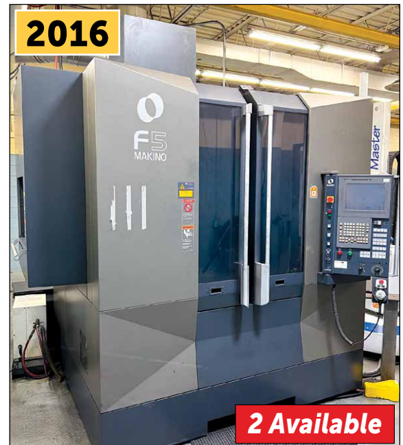
Makino F5 CNC Vertical Machining Center