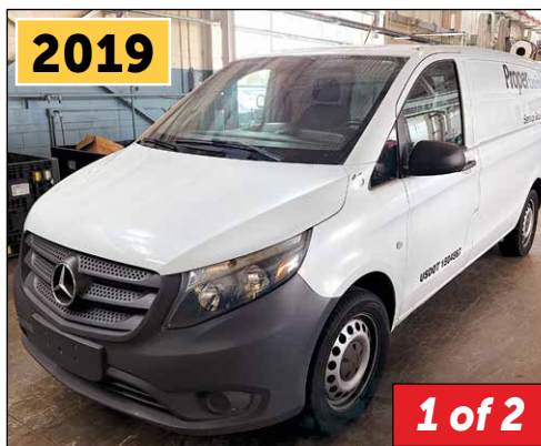
Mercedes-Benz Cargo Vans