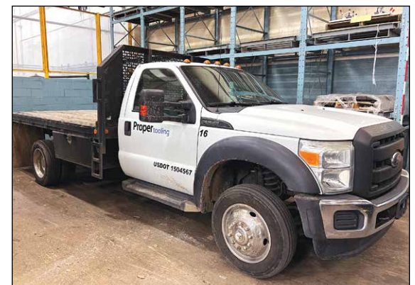
Ford F550 Flatbed Truck