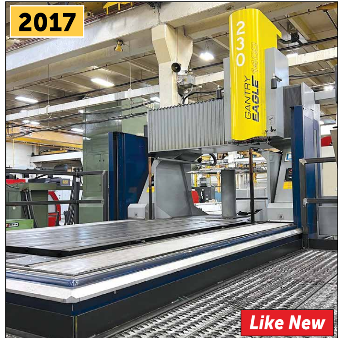
OPS Ingersoll Gantry Eagle1400 EDM