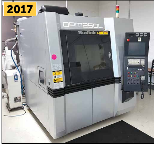
Sodick Metal 3D Printer