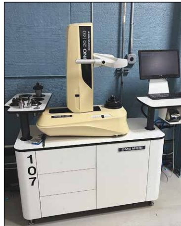
DMG Microset Tool Setter