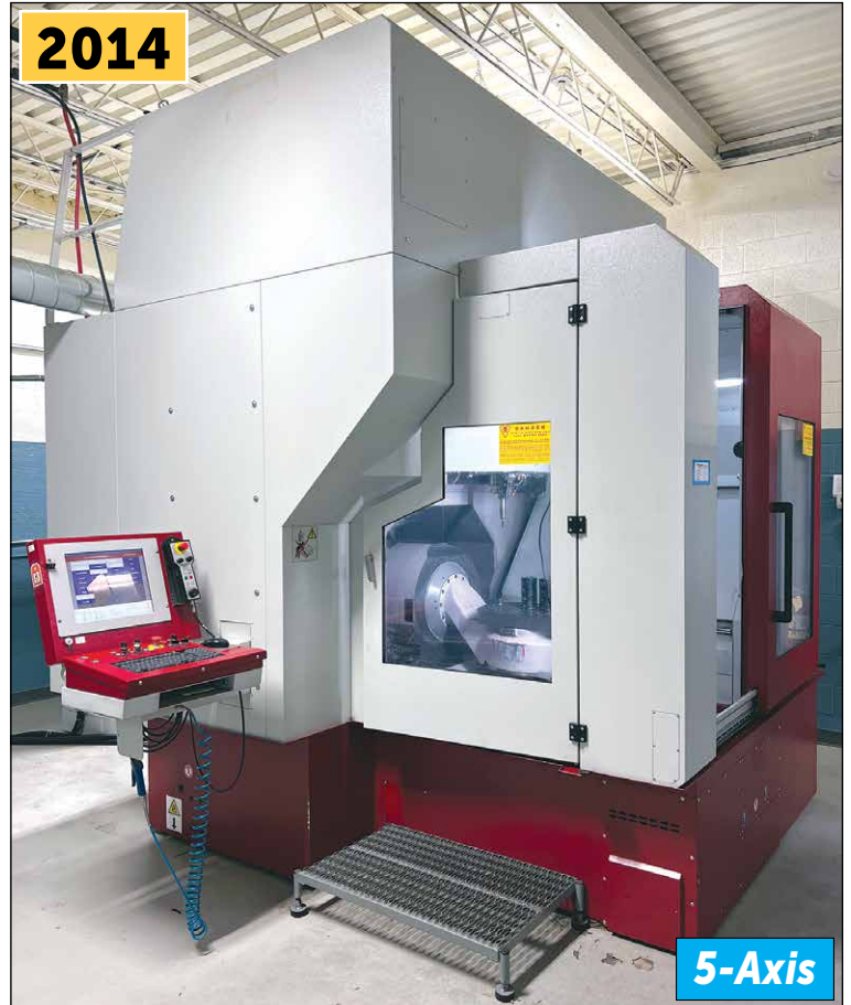
Roeders RXU1001DSH 5-Axis CNC Vertical Machining Center