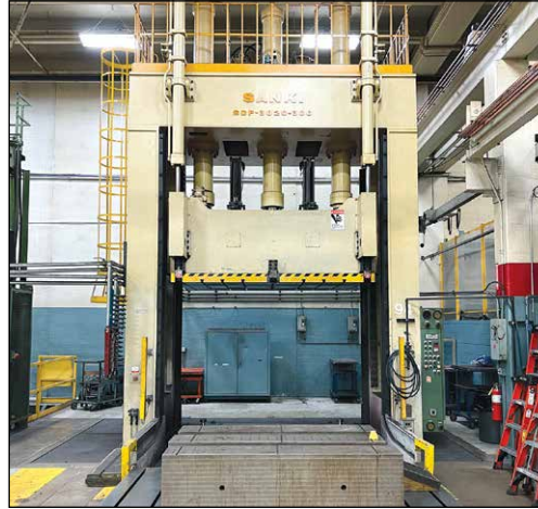
Sanki Hydraulic Spotting Press