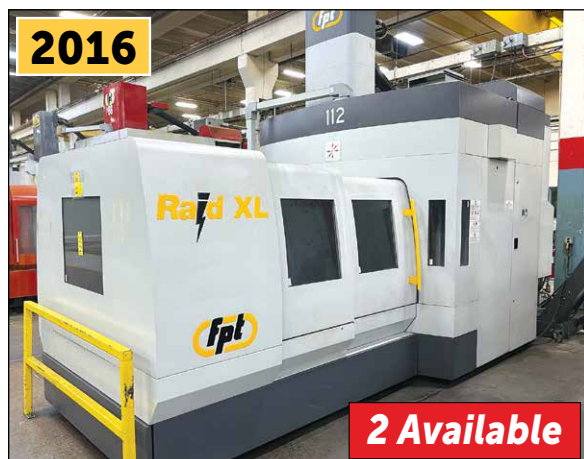
FPT Raid XL 3-Axis Dual Column CNC VMC