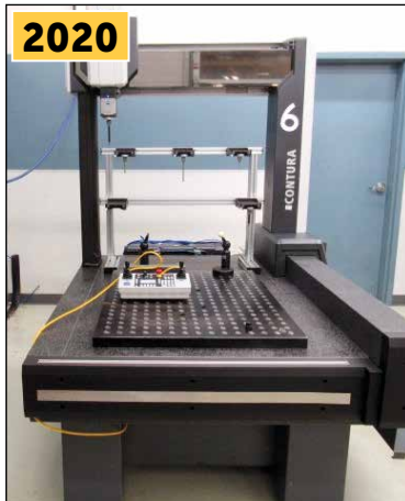
Zeiss Contura 6206 CMM