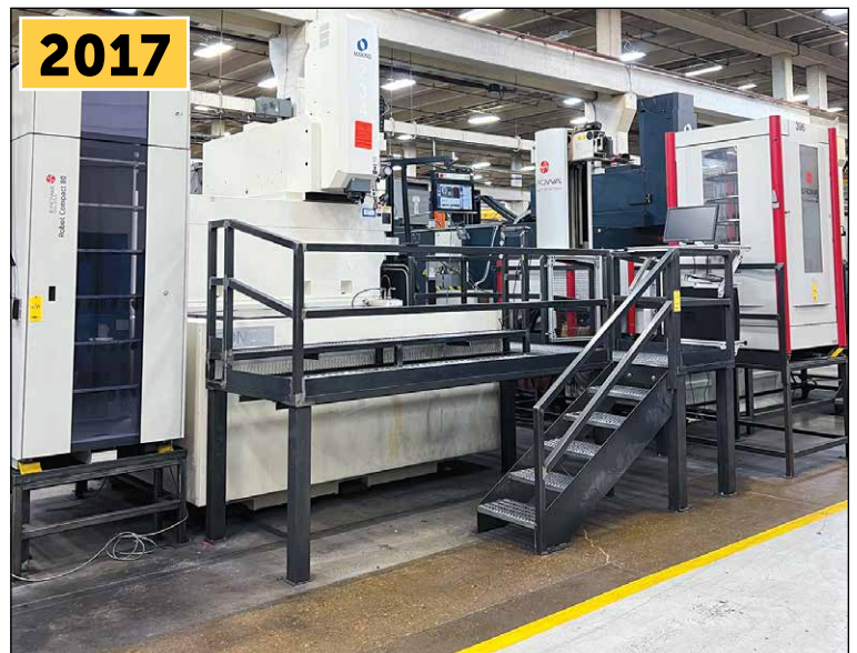
Makino EDNC15 CNC EDM