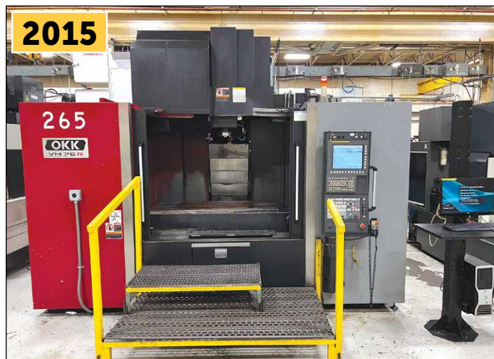
OKK VM76R CNC Vertical Machining Center