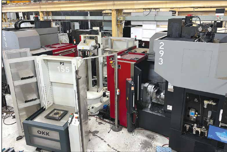
OKK VCP600 5-Axis Horizontal Machining Center