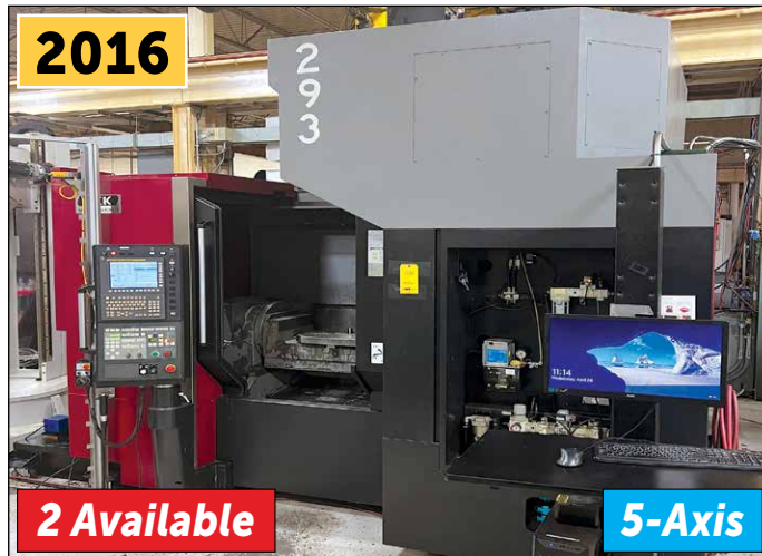
OKK VC-X500 5-Axis CNC VMC