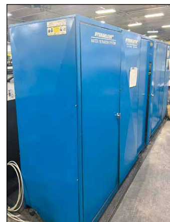
Hydrokleen HE/7000 Water Filtration System