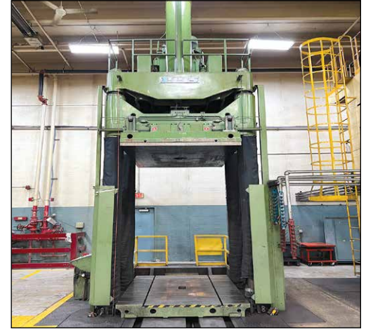
Reis Hydraulic Spotting Press