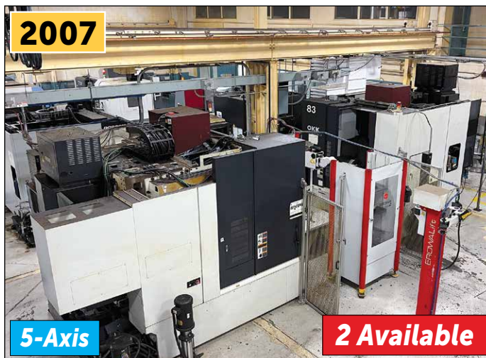
OKK VP600 5-Axis CNC Vertical Machining Center