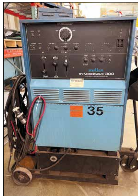
Miller Syncrowave Welding Power Source