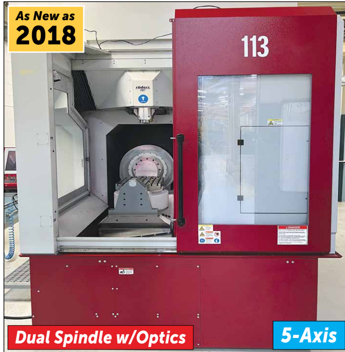
Roeders RXU1001DSHZ2 CNC VMC with Optics