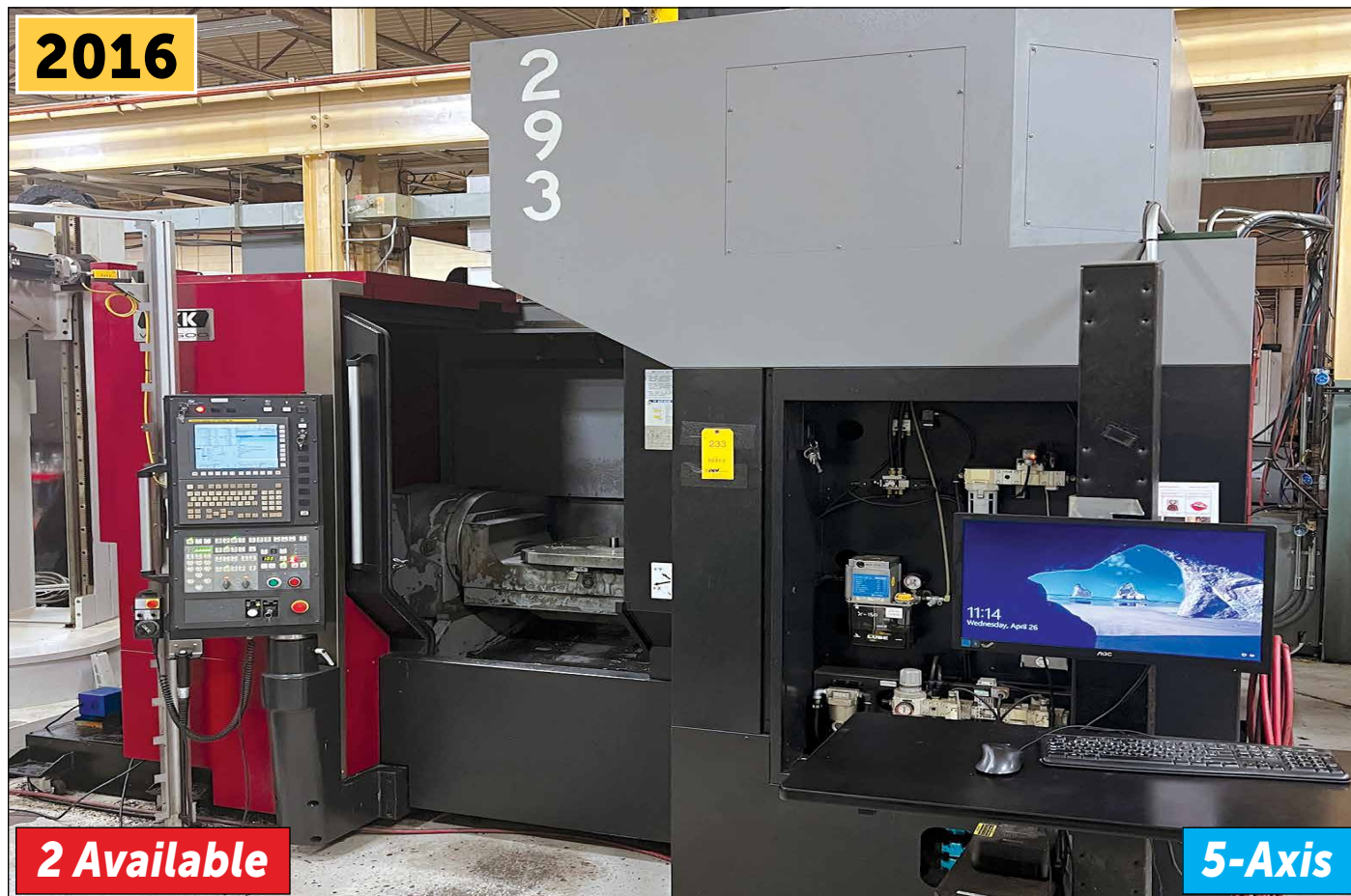
OKK VC-X500 5-Axis CNC VMC