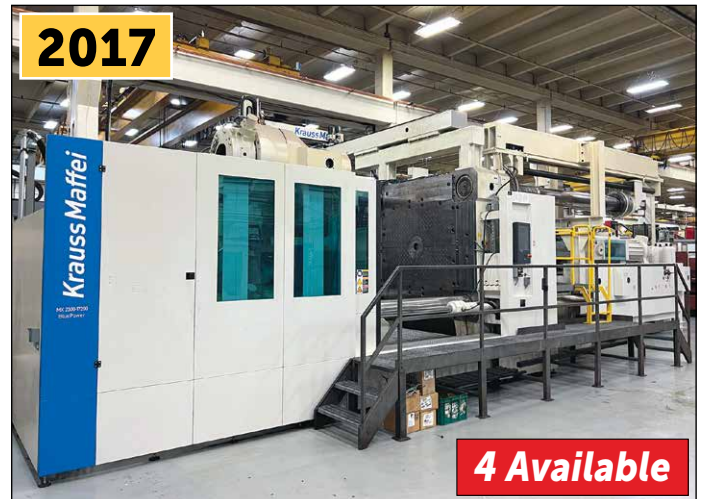
Krauss Maffei Blue Power MX 2300-17200 CNC Hydraulic Injection Molder