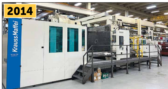
Krauss Maffei Blue Power MX 2300-17200, CNC Hyd. Injection Molder