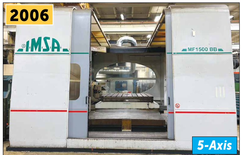
IMSA MF1500BB 5-Axis Horizontal Gun Drill