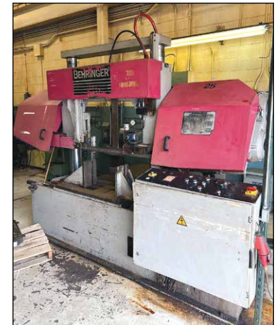
Behringer Horizontal Band Saw