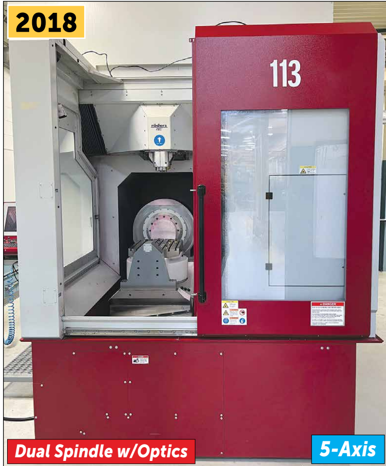
Roeders RXU1001DSHZ2 5-Axis CNC Vertical Machining Center