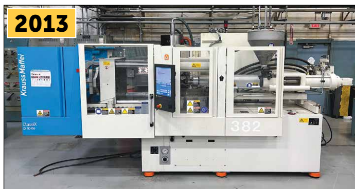
Krauss Maffei 110-750-750CX/110, 110-Ton CNC Hyd. Injection Molder