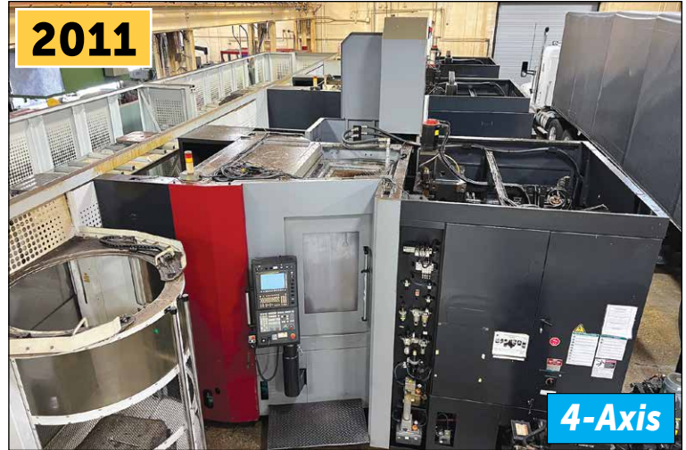
OKK HMC6300 4-Axis Horizontal Machining Center FMS