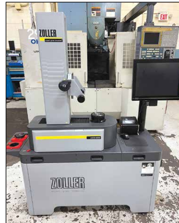
Zoller Tool Presetter