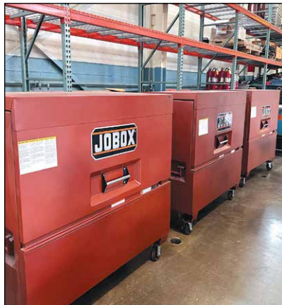
Jobox Tool Boxes