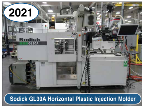
Sodick GL30A Horizontal Plastic Injection Molder