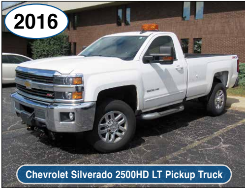
Chevrolet Silverado 2500HD LT Pickup Truck