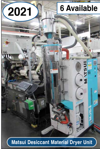
Matsui Desiccant Material Dryer Unit