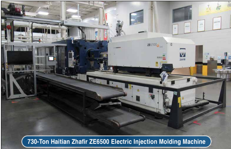
730-Ton Haitian Zhafir ZE6500 Electric Injection Molding Machine