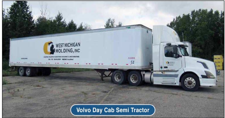
Volvo Day Cab Semi Tractor