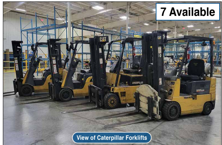
View of Caterpillar Forklifts

LEKTRO ELECTRIC MAINTENANCE CART , with Mounted Tool Box