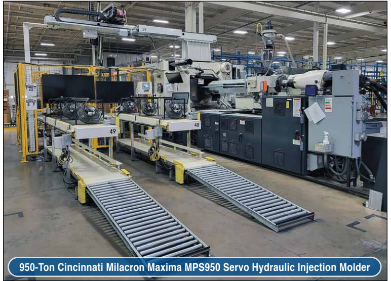
950-Ton Cincinnati Milacron Maxima MPS950 Servo Hydraulic Injection Molder