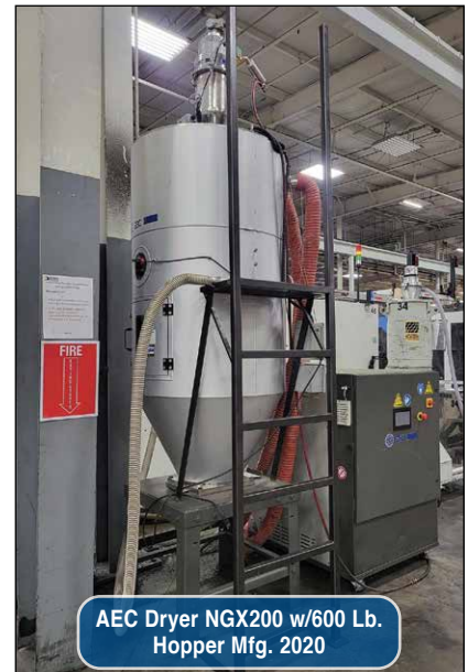
AEC Dryer NGX200 w/600 Lb. Hopper Mfg. 2020