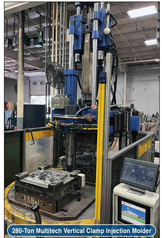
280-Ton Multitech Vertical Clamp Injection Molder