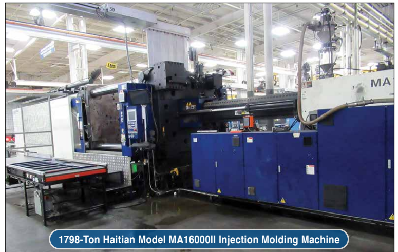
1798-Ton Haitian Model MA16000II Injection Molding Machine