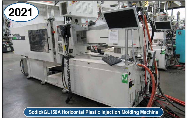
Sodick GL150A Horizontal Plastic Injection Molding Machine

VISIT WEBSITE AND BIDSPOTTER FOR COMPLETE SPECS, THE AUCTION IS UP: BidSpotter