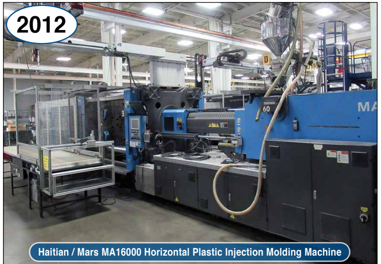
Haitian / Mars MA16000 Horizontal Plastic Injection Molding Machine