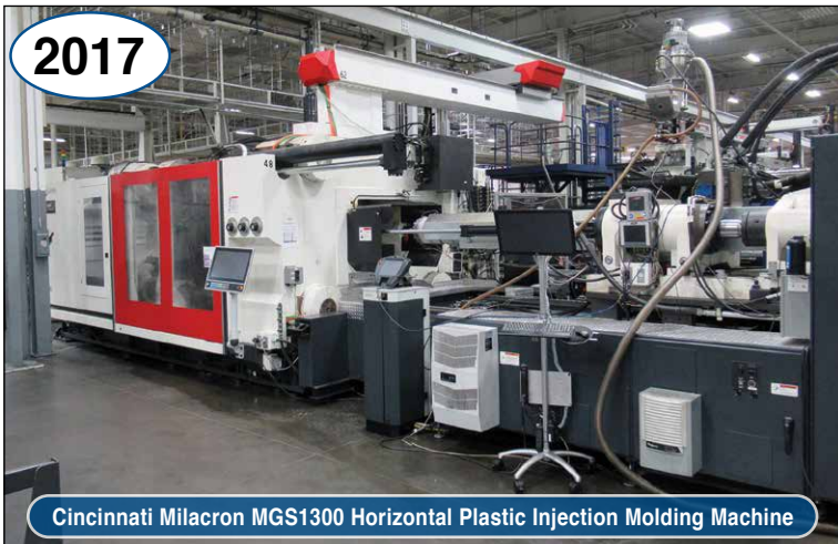
Cincinnati Milacron MGS1300 Horizontal Plastic Injection Molding Machine