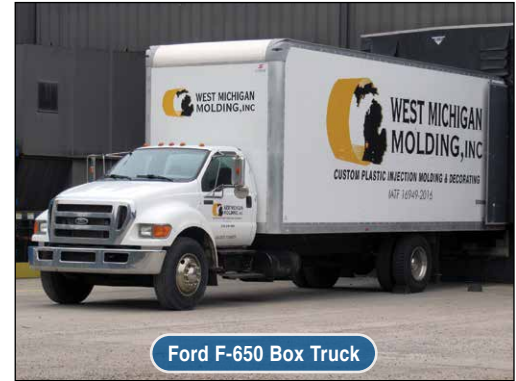
Ford F-650 Box Truck