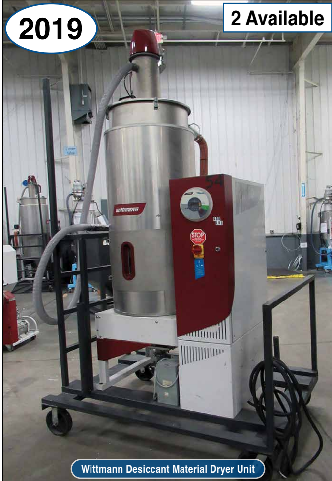
Wittmann Desiccant Material Dryer Unit