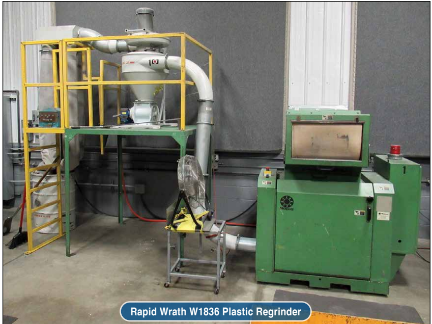
Rapid Wrath W1836 Plastic Regrinder