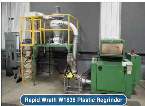
Rapid Wrath W1836 Plastic Regrinder