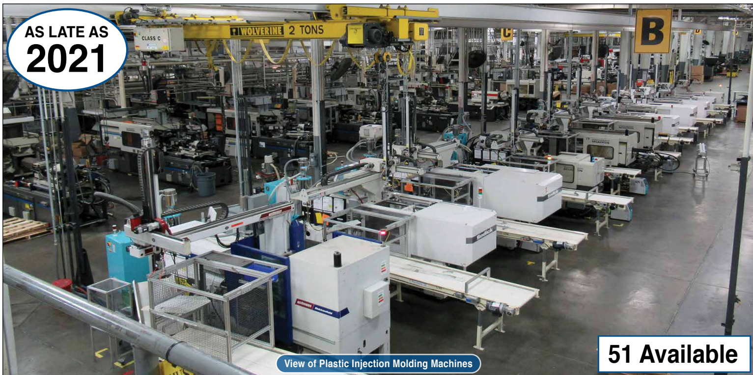
View of Plastic Injection Molding Machines