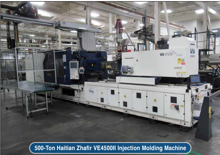
500-Ton Haitian Zhafir VE4500II Injection Molding Machine