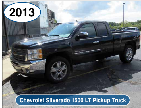
Chevrolet Silverado 1500 LT Pickup Truck