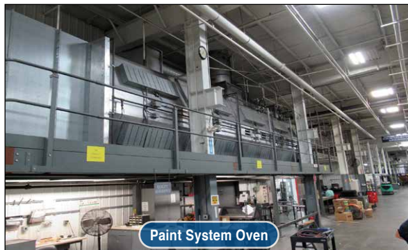
Paint System Oven