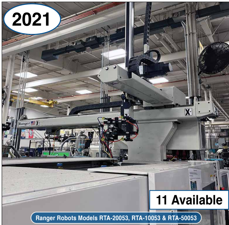
Ranger Robots Models RTA-20053, RTA-10053 & RTA-50053