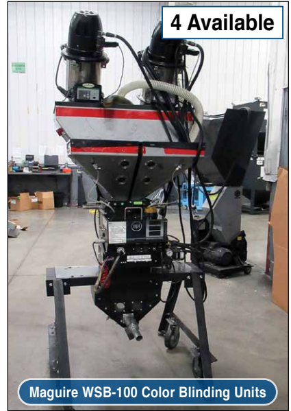
Maguire WSB-100 Color Blinding Units