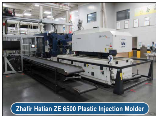
Zhafir Hatian ZE 6500 Plastic Injection Molder