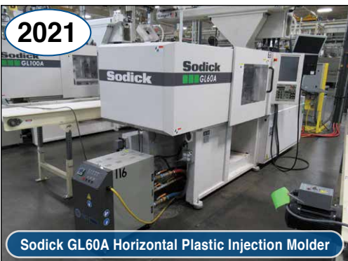
Sodick GL60A Horizontal Plastic Injection Molder