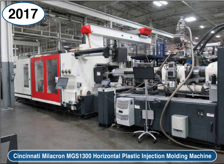
Cincinnati Milacron MGS1300 Horizontal Plastic Injection Molding Machine