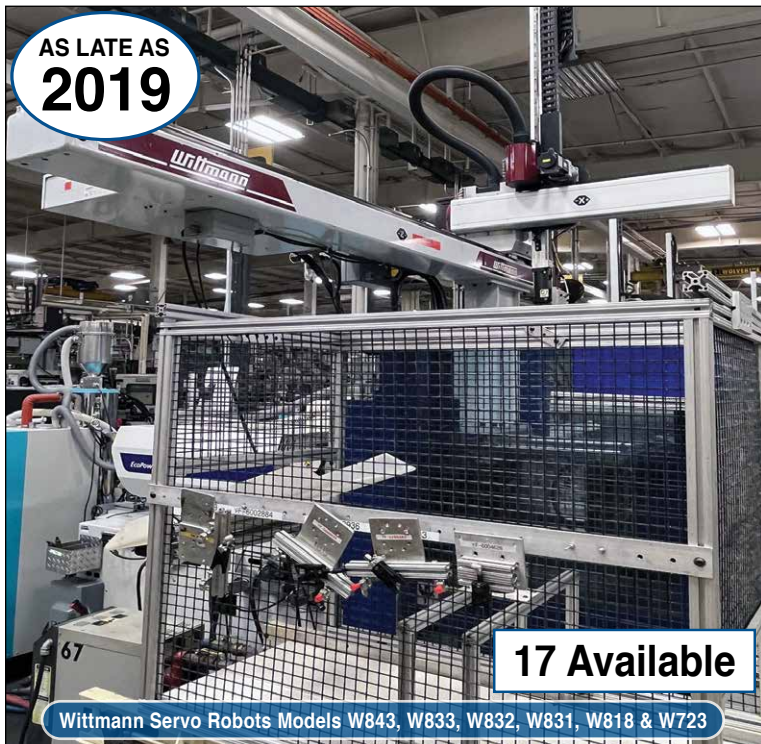
Wittmann Servo Robots Models W843, W833, W832, W831, W818 & W723